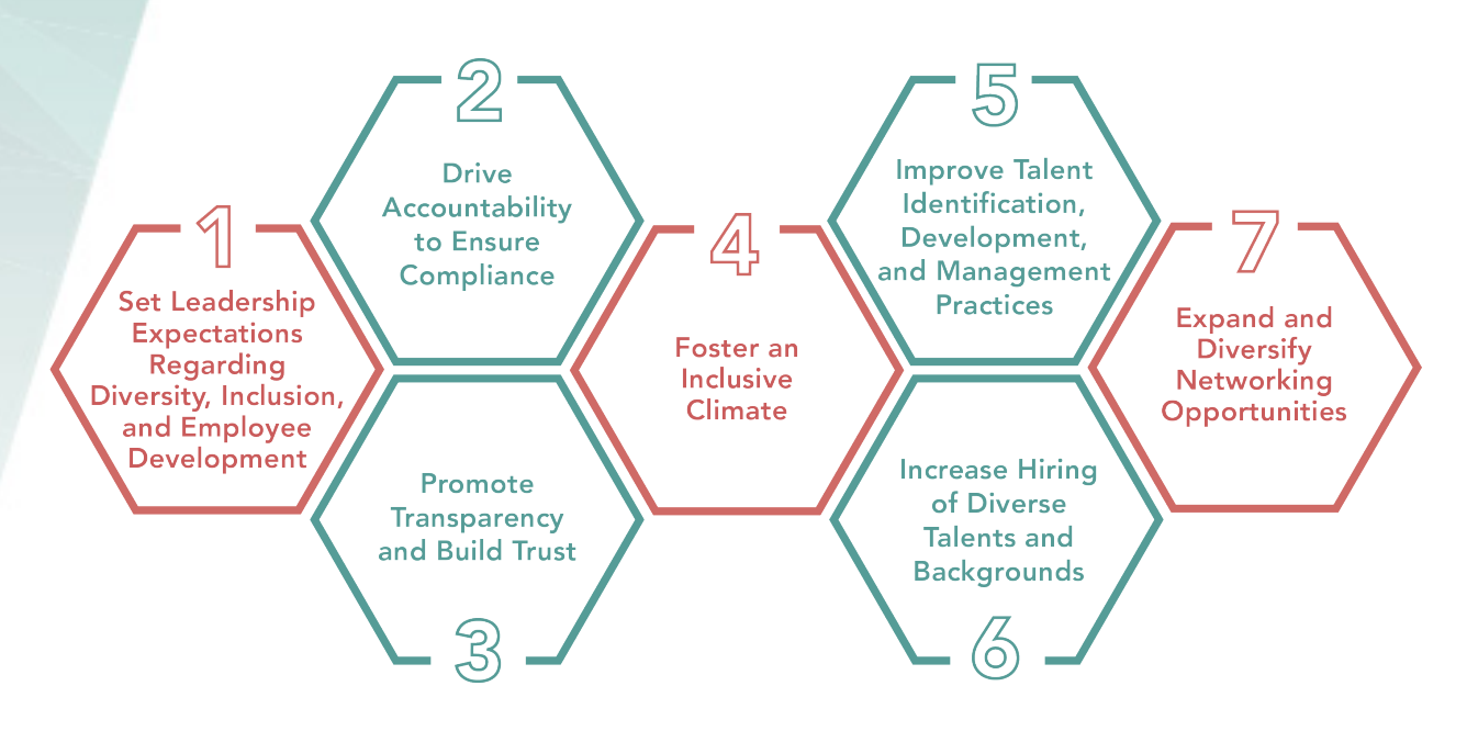
Figure 1: The Seven Recommendations from the Study