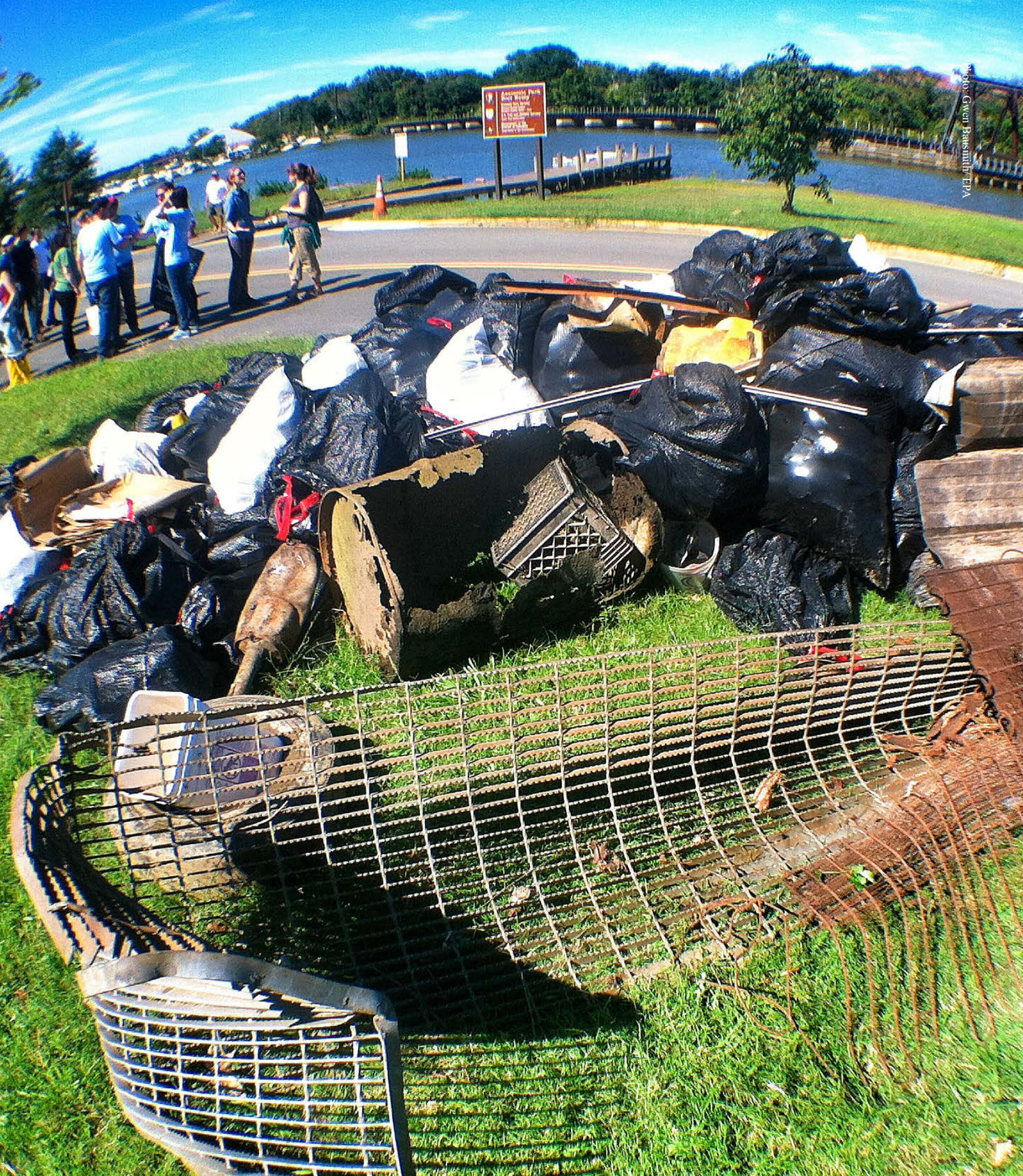
Volunteers at Anacostia Park in Washington, D.C. participate in the International Coastal Cleanup (ICC) event. The ICC is the largest global volunteer event on behalf of our world's oceans and waterways. On the third Saturday each September, volunteers join forces to clean up marine debris from inland to coastal regions.