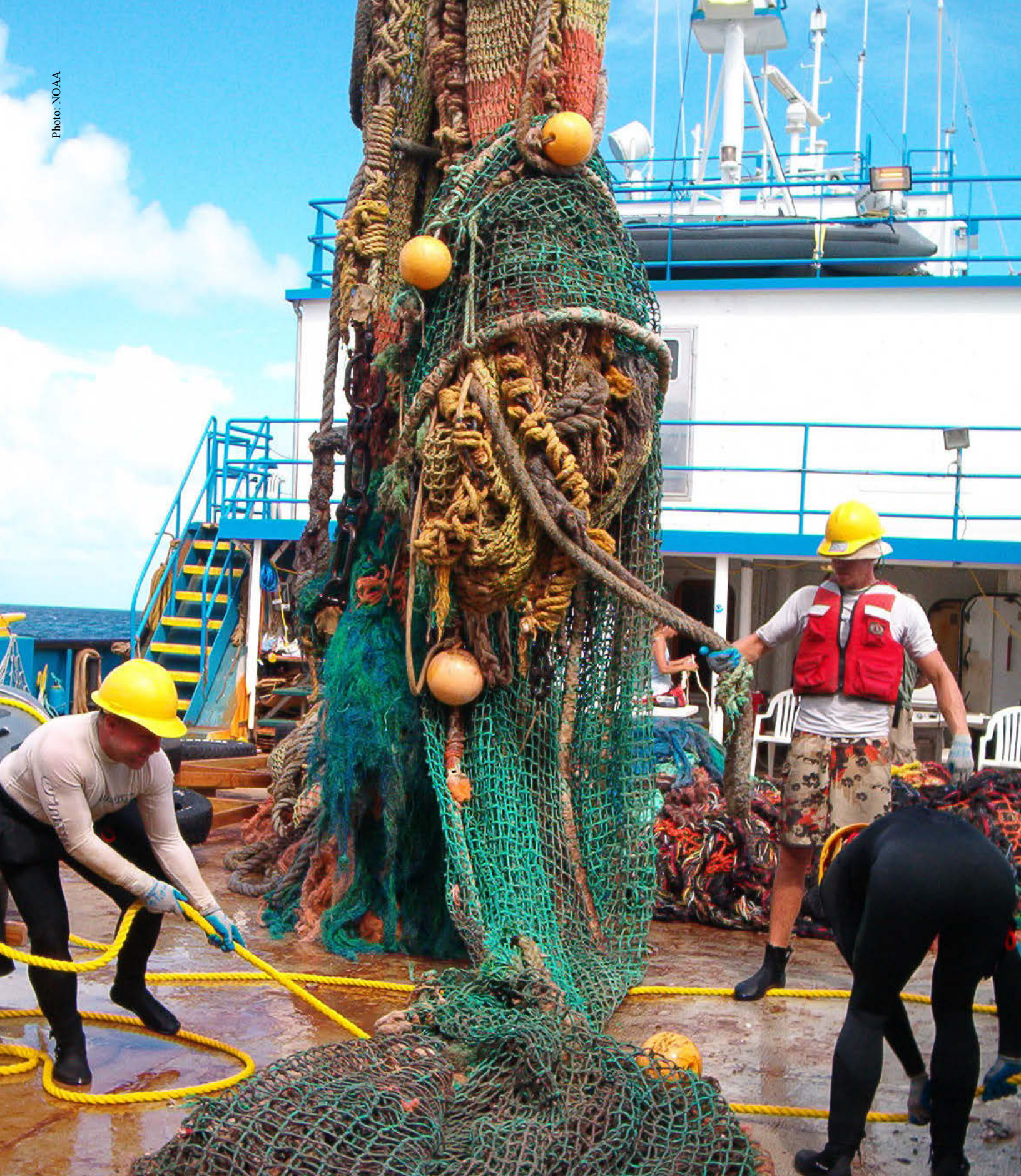
Fishing nets pulled up from the ocean column. When left in the ocean environment, derelict fishing gear can entangle, harm and even kill commercially important marine organisms through a process known as “ghost-fishing.”