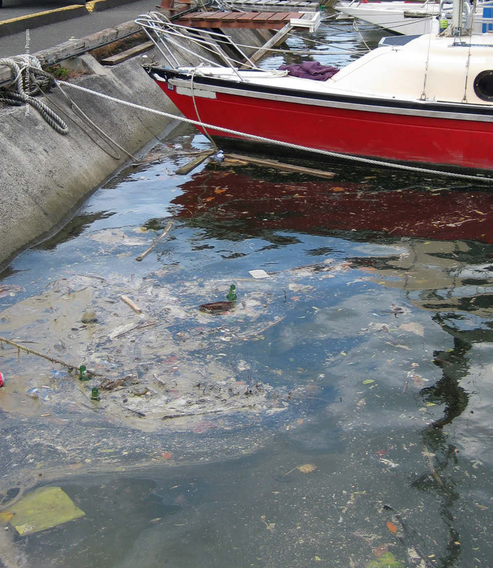
This polluted marina shows how trash can be eventually washed into the ocean, where it becomes marine debris. Marine debris can reach the ocean through stormwater run-off. Stormwater carries debris through storm drains, which eventually leads to an outfall, into a nearby water body, and into the ocean.