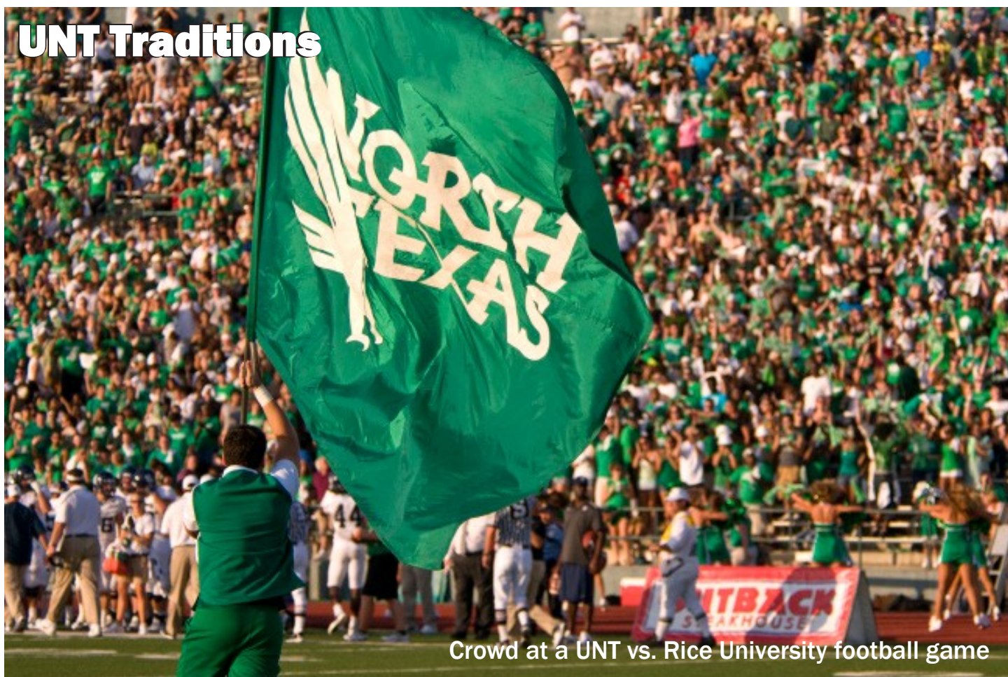
Crowd at a UNT vs. Rice University football game

Founded in 1890, the University of North Texas is the oldest and most comprehensive university in the North Texas region. With nearly 120 years of history, UNT has developed its own culture with traditions passed down through generations. Below is some information about UNT symbols, spirit, and history. You can read more detailed information about UNT's Spirit and Traditions on our website .