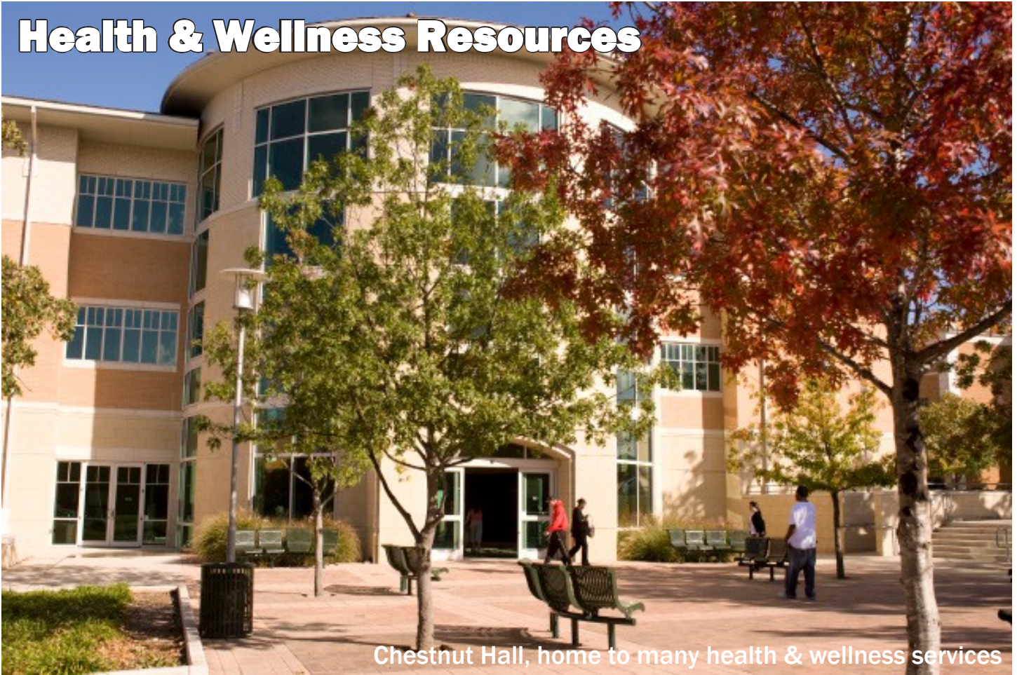
Chestnut Hall, home to many health & wellness services

UNT offers many health and wellness resources and services for enrolled students. Most of these services are supported through student fees, and therefore, are available at little to no cost. Make sure to take advantage!