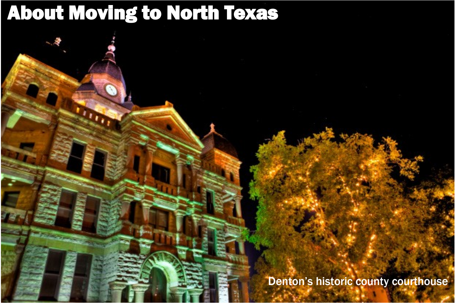
Denton's historic county courthouse

Denton is a true college town and is a really fun place to live. In this section, you will find information about traveling to UNT, where to live, what to bring, and what to do after you move here.