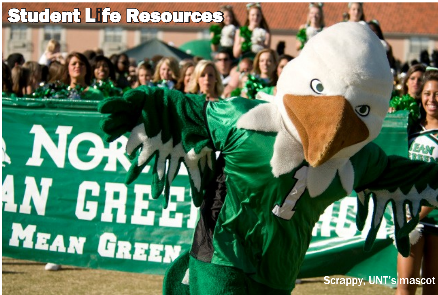
Scrappy, UNT's mascot