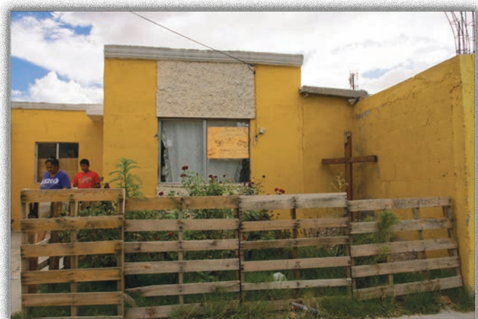
Ciudad, Juarez