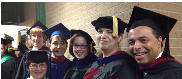
For more commencement photos, go to https://www.facebook.com/MaybornUNT .