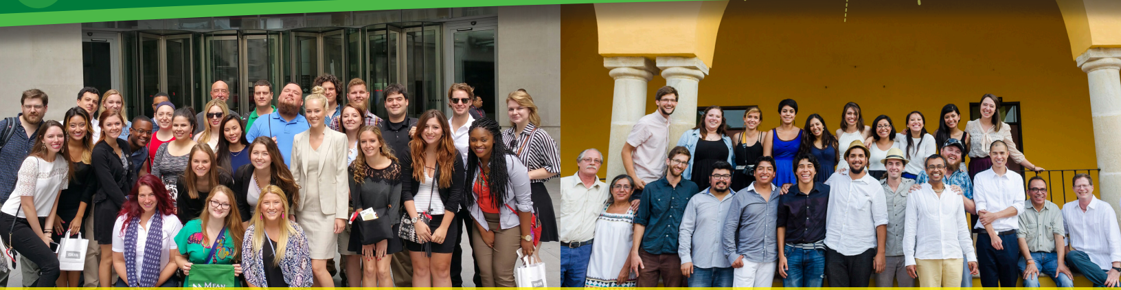
Mayborn students and faculty at BBC offices in London.