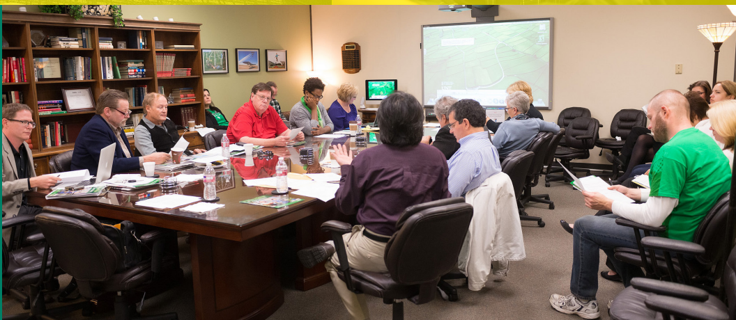
Mayborn faculty ramping up for another semester.

As the Mayborn School of Journalism swings into its 70th year of teaching excellence in journalism at the University of North Texas, faculty, students and staff shift into high gear – accelerating the pace of living, learning and loving what it means to be journalists and communicators in the fast-paced world around us.