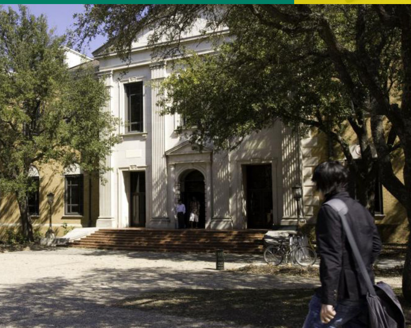
Growth leads to expansion into neighboring Sycamore Hall.