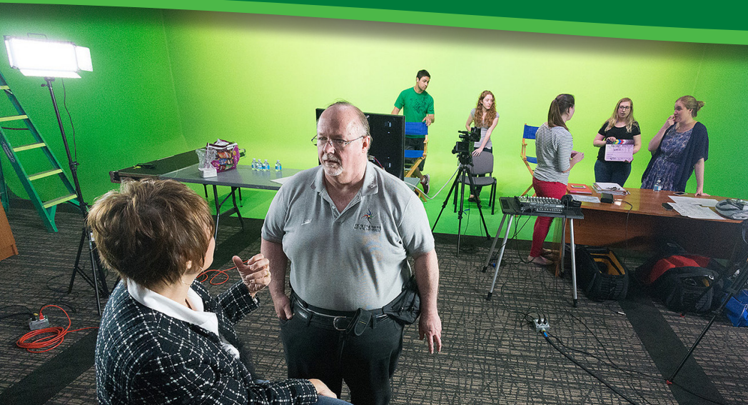
SWOOP students perfecting another advertising video shoot.