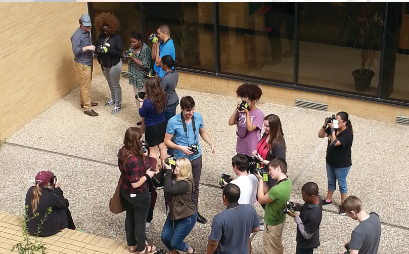
Mayborn photography students explore new techniques.