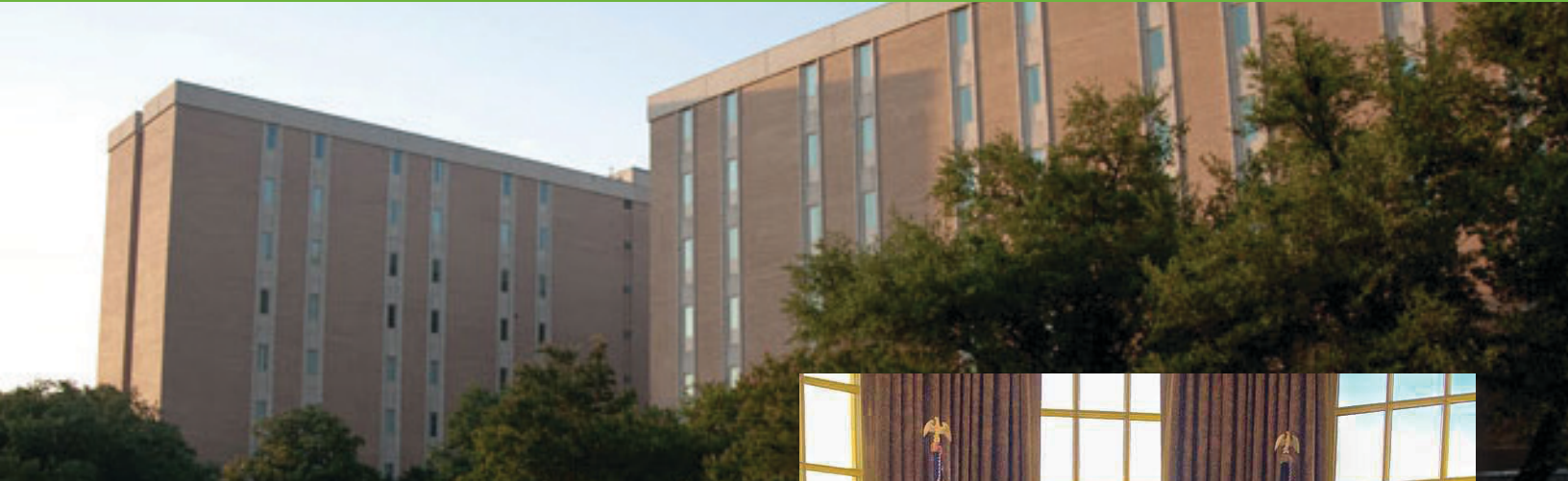
Mayborn LLC participants live on campus at Kerr Hall.

T he REAL – Residents Engaged in Academic Learning – programs are in widespread use at universities all across the country. Students at the Mayborn School of Journalism benefit from the opportunity to live and learn with like-minded undergraduates at UNT’s LLC (Living Learning Communities) program at Kerr Hall.