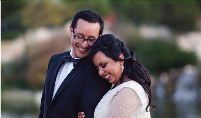
Mayborn journalists use words “I do.”