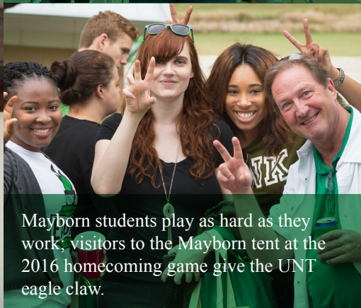
Mayborn students play as hard as they work; visitors to the Mayborn tent at the 2016 homecoming game give the UNT eagle claw.