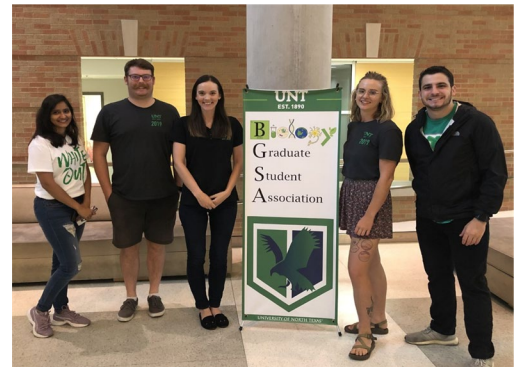
BGSA Committee FY2020