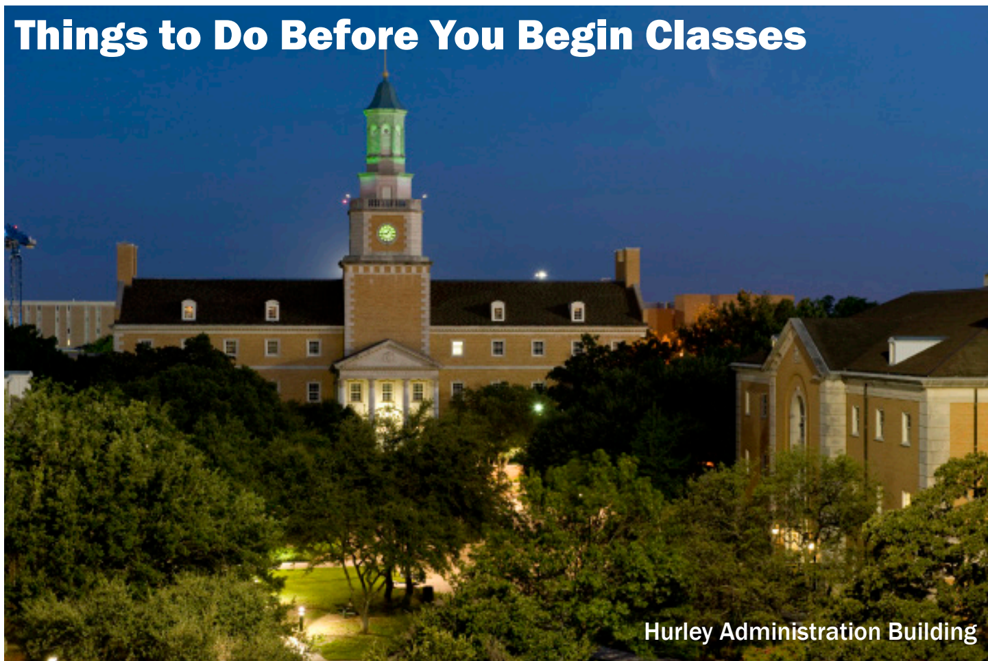
Hurley Administration Building

Once you are admitted, you need to begin making arrangements to become a UNT student. This section of the manual guides you through the things you need to do before you begin classes. If your plans have changed, you can learn how to update your application or change your major by skipping to the section Things to Do if Your Plans Have Changed .