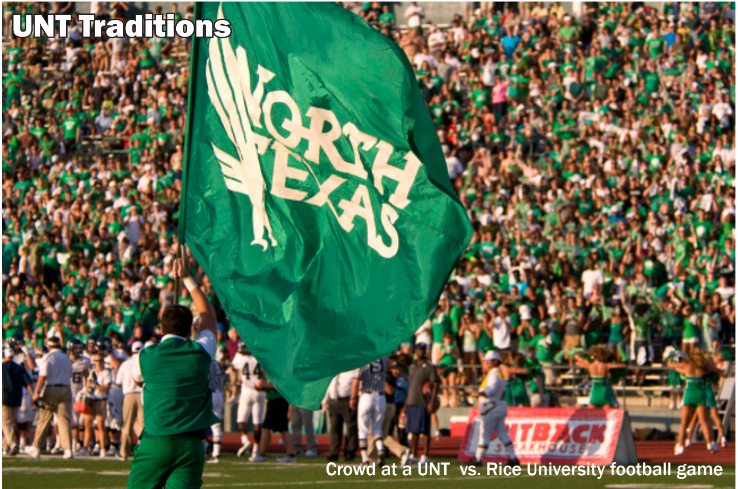
Crowd at a UNT vs. Rice University football game

Founded in 1890, the University of North Texas is the oldest and most comprehensive university in the North Texas region. With nearly 120 years of history, UNT has developed its own culture with traditions passed down through generations. Below is some information about UNT symbols, spirit, and history. You can read more detailed information about UNT's Spirit and Traditions on our website .