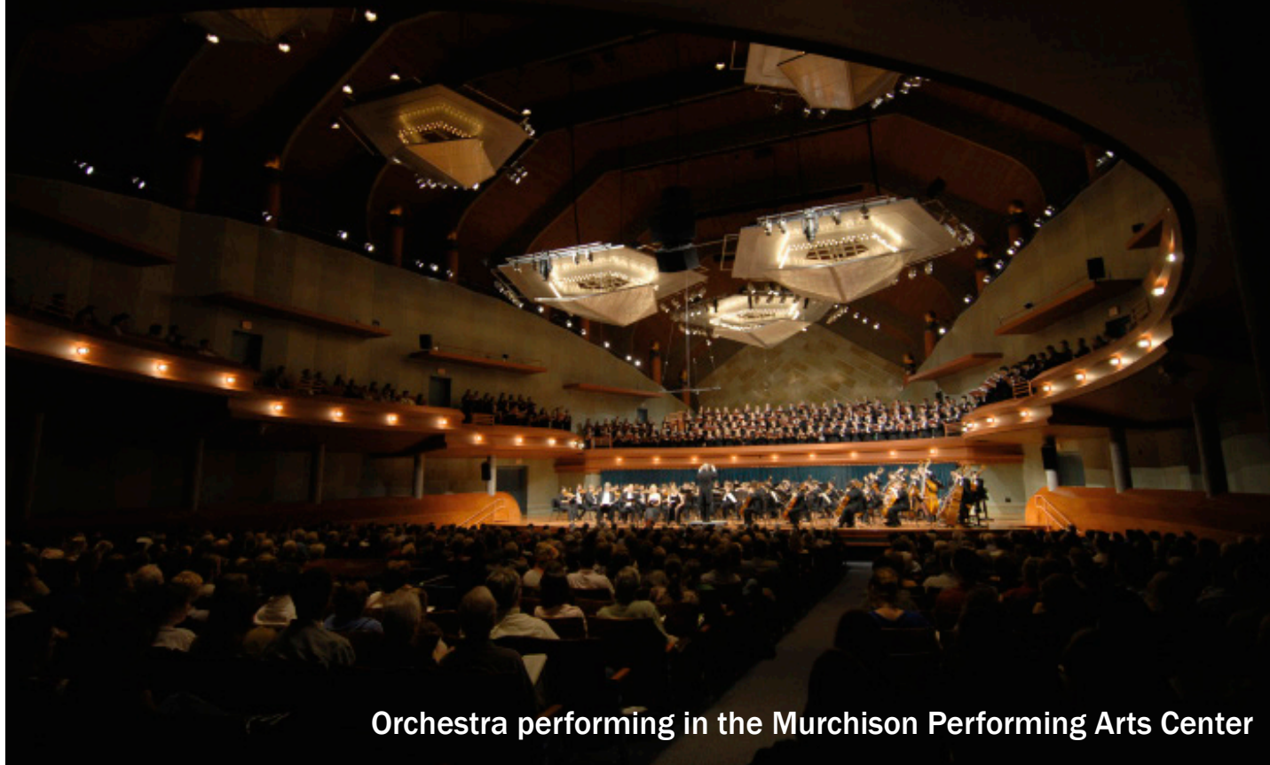
Orchestra performing in the Murchison Performing Arts Center

We understand that sometimes life gets in the way, and you might need to update your application, change your anticipated program or take leveling courses to meet the requirements for your program. In this section, you will learn what you need to do in these situations.