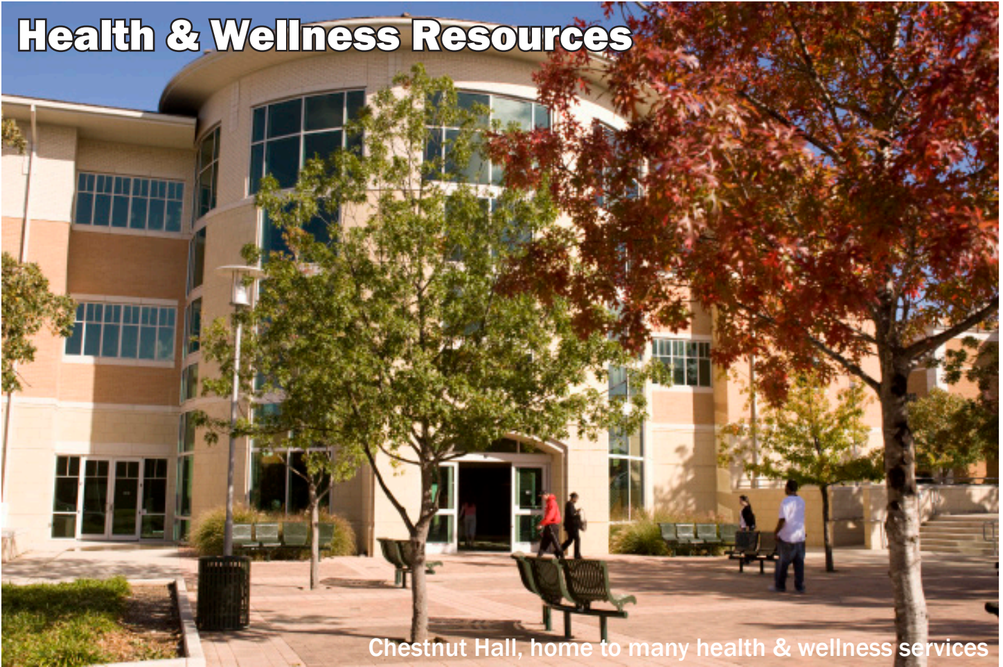
Chestnut Hall, home to many health & wellness services

UNT offers many health and wellness resources and services for enrolled students. Most of these services are supported through student fees, and therefore, are available at little to no cost. Make sure to take advantage!