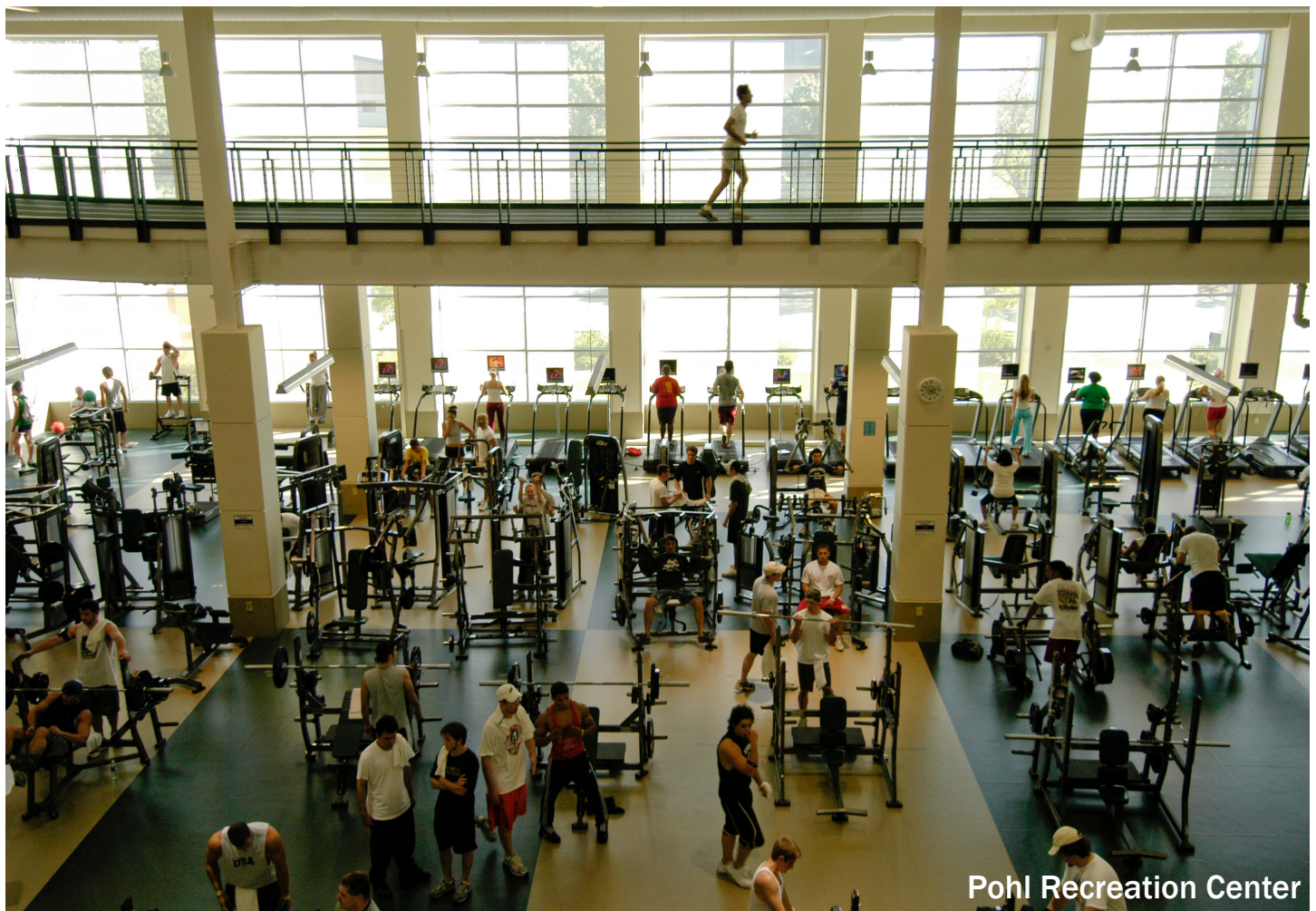
Pohl Recreation Center

UNT has a 138,000 square foot recreation center. Amenities include basketball courts, volleyball courts, weight and fitness rooms, indoor climbing wall, lap pool, leisure pool, aerobic rooms, 1/8 mile track, and outdoor basketball and volleyball courts. Group exercise, personal training, and outdoor pursuits are also available. Your membership is included for each semester you are enrolled.