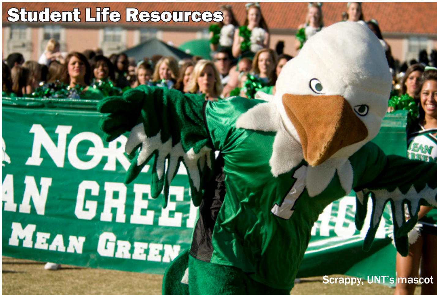
Scrappy, UNT's mascot