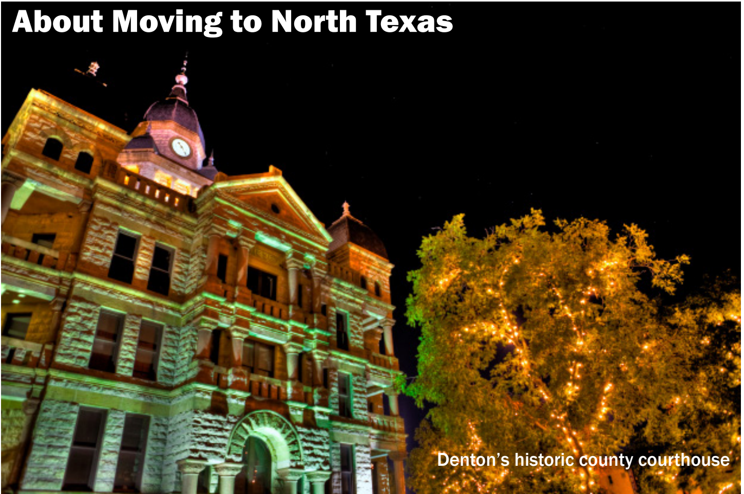
Denton's historic county courthouse

Denton is a true college town and is a really fun place to live. In this section, you will find information about traveling to UNT, where to live, what to bring, and what to do after you move here.