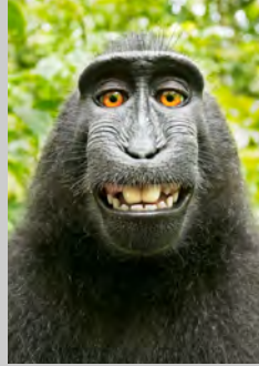
Above: Posing to take its own photograph, unworried by its own reflection, even smiling. Surely a sign of self-awareness?