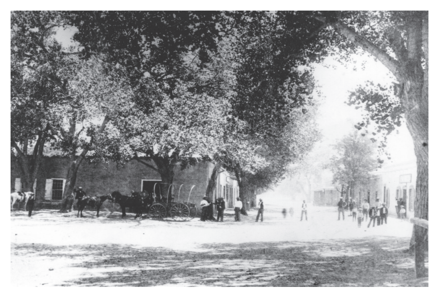
Mesilla. The Plaza, circa 1880