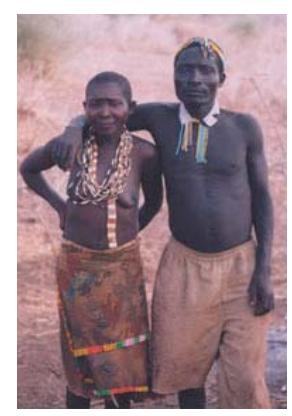
Hadza couple with woman wearing marriage skirt.