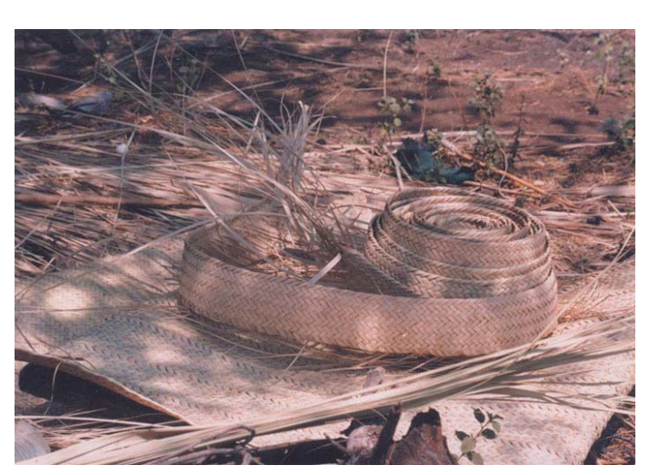
Hadza basketry, in process.