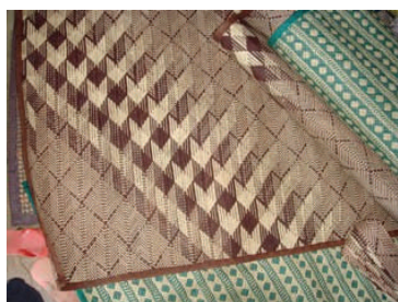
Sample of Ugandan barkcloth weaving technique.