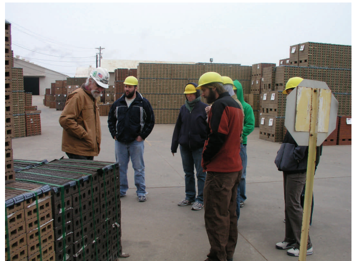
A number of our Clay Guild members getting the formal tour at the Acme Brick plant in Denton, Texas.