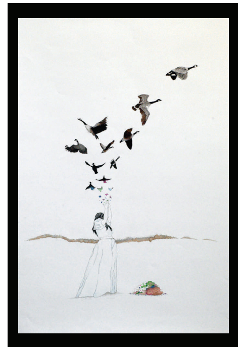
Sister Winter, Mark Raymer, ink on paper.

"THE EXHIBITION DEMONSTRATED THE RIGOROUS CRITICAL INQUIRY, PRACTICAL SKILL-BUILDING AND VISUAL EXPLORATION PRACTICED BY THE ... STUDENTS"