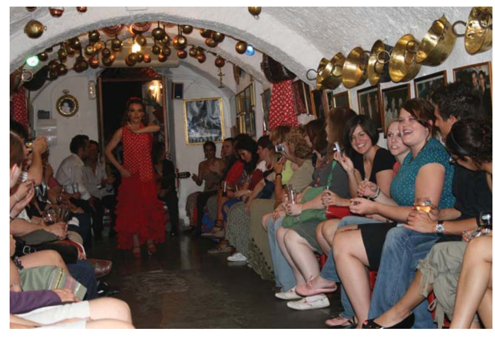
Students enjoying gypsy Flamenco in Spain.

a marvelous time and returned exhilarated and exhausted yet with a new appreciation for the unique art and culture of Spain. •