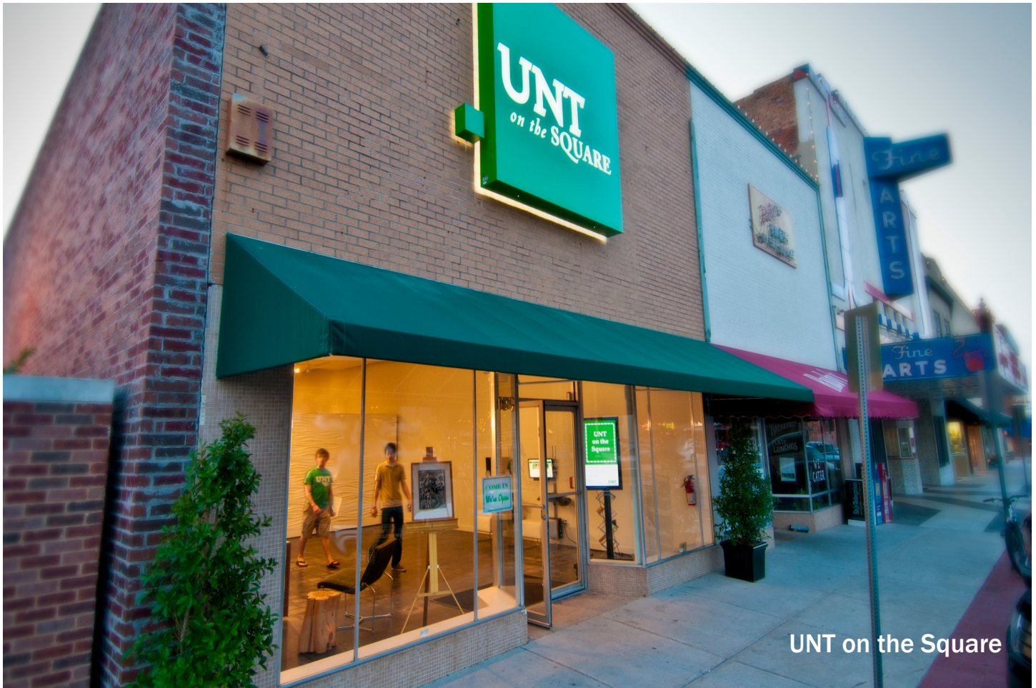
UNT on the Square