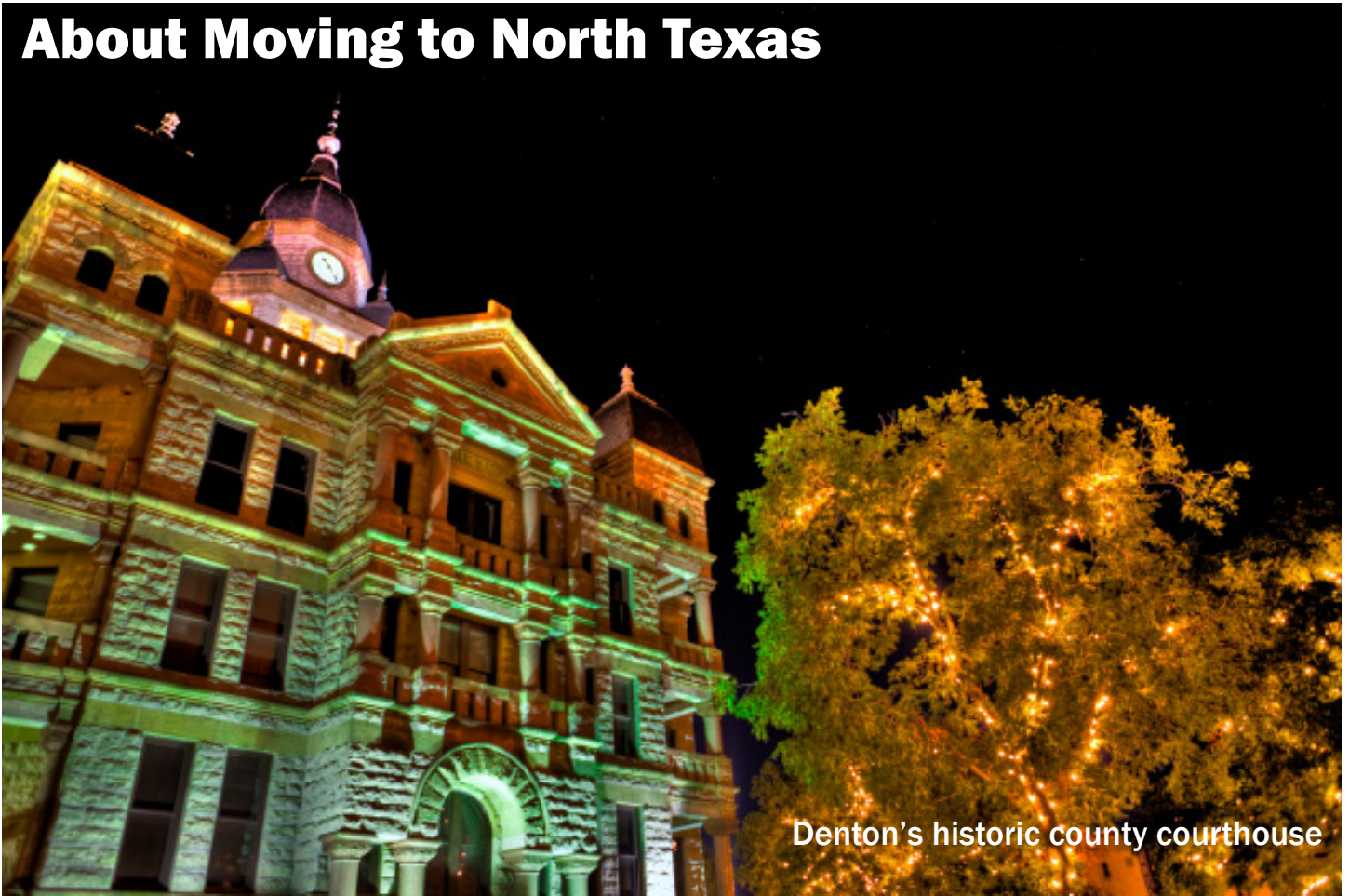
Denton's historic county courthouse

Denton is a true college town and is a really fun place to live. In this section, you will find information about traveling to UNT, where to live, what to bring, and what to do after you move here.