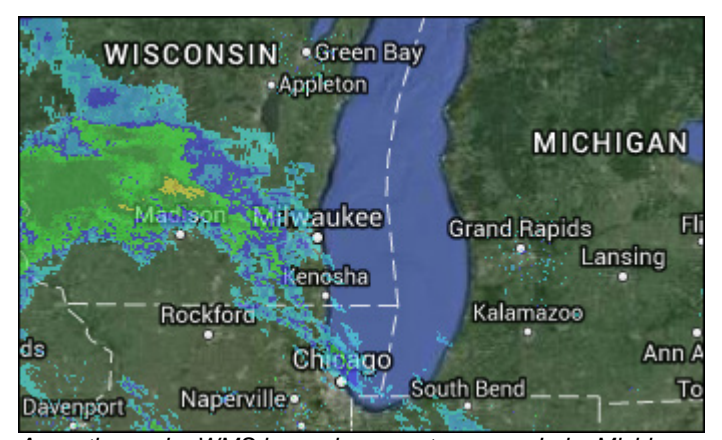
A weather radar WMS layer shows a storm near Lake Michigan.

MARPLOT has a variety of different basemaps that you can use as the background image for your map, including both satellite and street view maps with global coverage. The basemaps are provided by online services, so that they are showing the latest information. Additionally, MARPLOT also offers the ability to download basemap tiles for offline use.