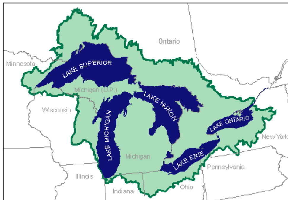
Figure 1. Map of the Great Lakes Basin.

Marine debris is defined as any persistent solid material that is manufactured or processed and directly or indirectly, intentionally or unintentionally, disposed of or abandoned into the marine environment or the Great Lakes. While perhaps more commonly thought of as an oceanic problem, the Great Lakes region, with its complex system of habitats, wetlands, rivers, and tributaries, is an area that is also affected by debris. In the Great Lakes, marine debris affects the beauty of our environment, is a health and safety hazard, threatens our wildlife and natural resources, and comes at an economic cost. From a beach covered in trash to an animal entangled in fishing line, marine debris is a problem we cannot ignore.