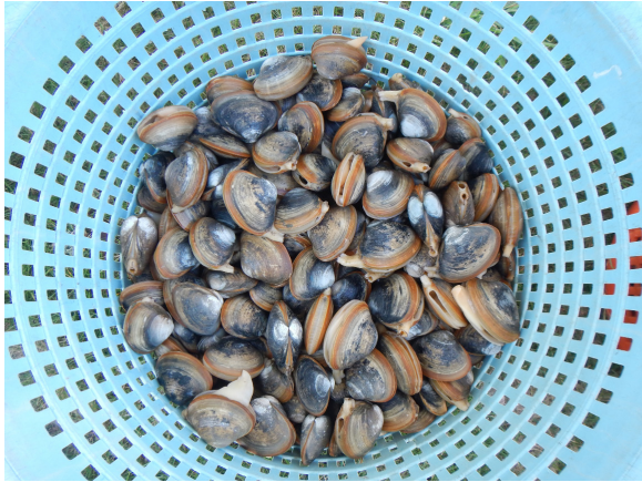
Basket of surf clams harvested after one year of growth.

Woods Hole Sea Grant is one of 33 Sea Grant college programs and is based at the Woods Hole Oceanographic Institution in Massachusetts.