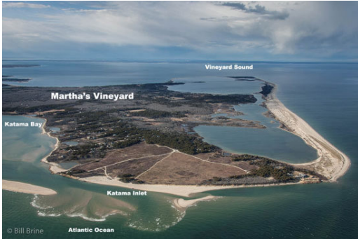
Attendees of the Martha's Vineyard Coastal Conference traveled to Chappaquiddick Island where they could observe the changes to the Katama barrier beach system and shoreline.