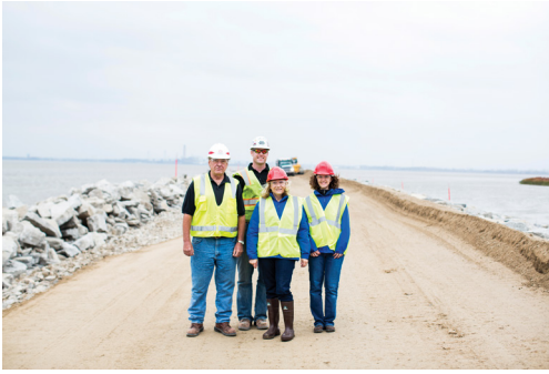
Sea Grant was integral in the Cat Islands rebuilding project.

“The restoration of the Cat Islands is a win-win that demonstrates the economics and environmental benefits of reusing dredged material.”