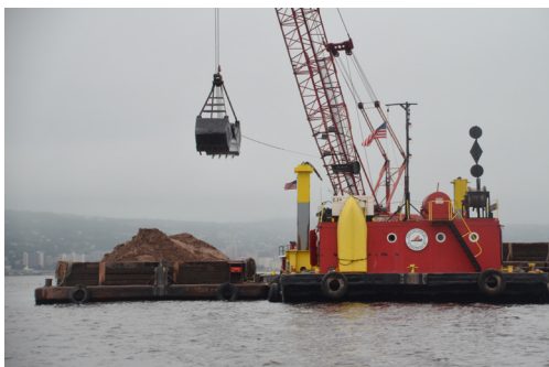
Sea Grant advises dredged material storage in the Duluth-Superior Port.

The Duluth-Superior Port is the world's largest inland facility and generates $12.6 billion in annual economic activity, which in turn provides 73,719 jobs and $3.2 billion in personal income. Wisconsin Sea Grant serves as a vital resource for the port's longevity by advising on dredging activities and dredged material storage, updates to the port land-use plan, and the protection of critical infrastructure from freshwater corrosion of steel plates. In 2015, Wisconsin Sea Grant advised seven companies located around the port saving $6.1 million in infrastructure replacement costs.