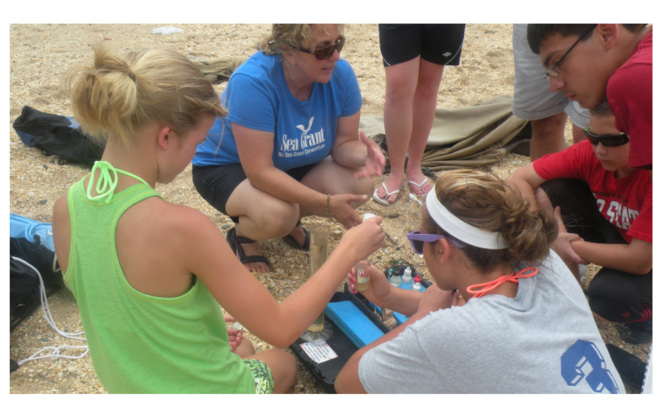
In a coastal field setting, a Sea Grant educator teaches students about water quality and how it impacts the habitat they are studying.