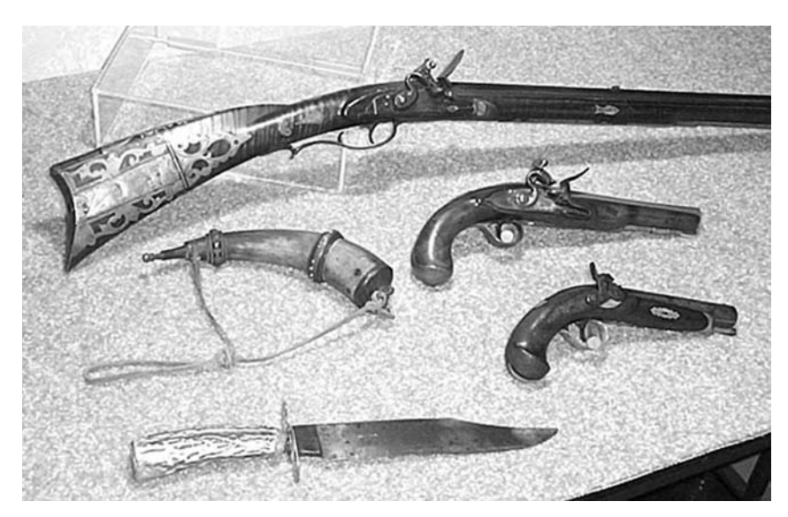
TEXAS FRONTIER WEAPONS

( Above ) Cross section of the 1830s rangers' tools of the trade. At top is an 1820s era .48 caliber Pennsylvania/Kentucky flintlock rifle. Directly below is a .60 caliber Ketland flintlock pistol. The slightly shorter barreled pistol is a .52 caliber Deringer pocket pistol. Noted for his quality craftsmanship, Henry Deringer Jr. began manufacturing large caliber pistols in Philadelphia in 1806. Also shown are a nineteenth century powder horn and a Bowie knife. A staple of the early ranger's equipment, such a knife was an important secondary weapon, as well as an early camp tool.