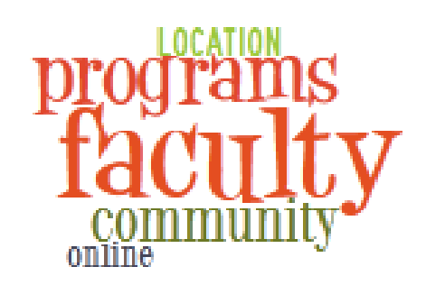
Chart 7: Top Topics Relative to Student Needs

Respondents report programs as a top UNT asset second only to faculty. References to programs focused on the flexibility, high quality, accessibility and cost of programs. The high quality of online programming was also a focal point regarding programs. There are, however, some concerns. Some respondents wished they had known more details about the curriculum and faculty. Still others expressed concern over the lack of opportunities for field work, internships, teaching and research experience, as well as course availability.