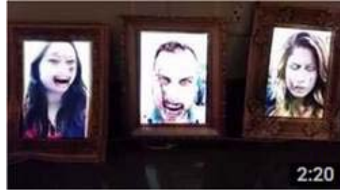
2015 DLIT Haunted Mansion https://www.youtube.com/watch?v=0DfKW9u03BI