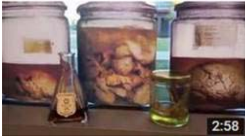
2015 DLIT Asylum for the Criminally Insane https://www.youtube.com/watch?v=NYB7p_Ck8x0