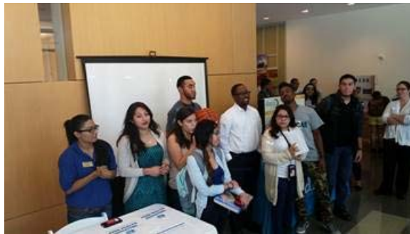
"It's On Us" Video Premier – Jag Fest (09/02/15)