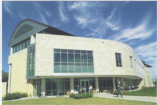
Opposite page: Tarrant County College supports the area workforce with graduates of its two-year aviation mechanic degree. Above left: Students earn logistics undergraduate degrees through the University of North Texas' Center for Logistics Education and Research. Above middle: The University of Texas – Arlington is a strong research university and offers the resources of the Texas Manufacturing Assistance Center to area companies. Above right: Texas Christian University offers a logistics undergraduate degree through its Supply and Value Chain Center. Many of the courses are held in the Smith Entrepreneur Hall, pictured above.

Transportation, Texas has more than four times the number of aviation jobs than the national average, and that annual wages for aviation employment are consistently 17 percent higher than average U.S. wages. Backed with this data, higher education institutions are taking note and developing programs to meet the demand for a skilled workforce.