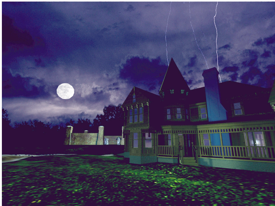
Figure 3. A view of the Chalk House within the Created Realities game framework.

In terms of the reading comprehension goals, the dialogue texts of various characters, objects, and archival materials in the space required that students read for multiple purposes such as: 1.) identifying relevant information, 2.) developing a context for their reading, 3.) entertainment, 4.) rereading when comprehension is unclear, and 5.) investigating the unknown, and 6.) making predictions and inferences using textual features and imagery such as pictures, paintings, and three dimensional images. As such, students are required to switch between reading purposes as they work through the learning tasks.