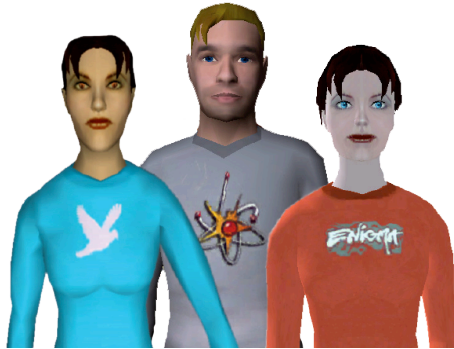
Figure 2. Three characters from the Chalk House.

who will comment on their use of vocabulary within their written piece as well as their and depth of comprehension of text passages. These passages are encountered in the form of character dialogue and interaction with 3-D objects that provide information that can help learners complete game tasks, add detail to their writing, or provide further clarification of advanced vocabulary terms that students must understand in order to solve puzzles or write their stories. By having students engage with text that forces them to continuously engage in a process of comprehension of text followed by retelling, our goal is to help develop automaticity in reading comprehension more rapidly than is traditionally encountered (Samuels, 2002; Stewart, 2004).