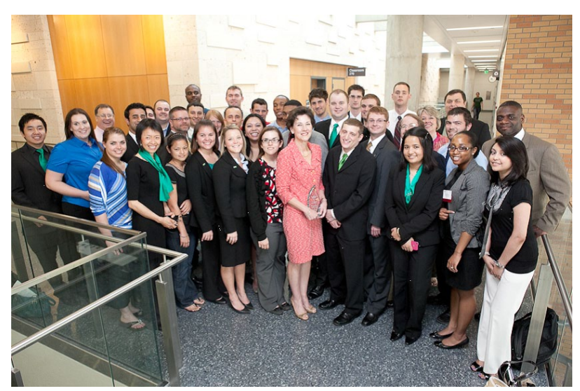
Commissioner Kitzman with RMI Faculty, Students, and Alums

Commissioner Kitzman's remarks included a wide range of current topics related to the Texas insurance market. More than 120 risk management and insurance industry representatives and UNT students and faculty attended the event.