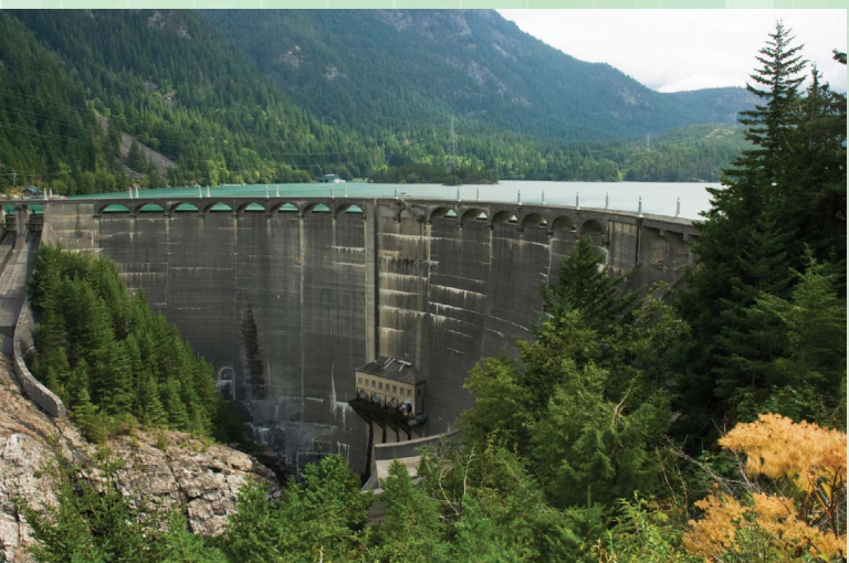
Skagit River Project- Diablo Dam, WA

Specific instructions for filing exhibit drawings and GIS data are included in Commission Orders that require the filing of this information. Additional information can be found here: http://www.ferc.gov/industries/hydropower/gen-info/guidelines/drawings-guide.pdf .