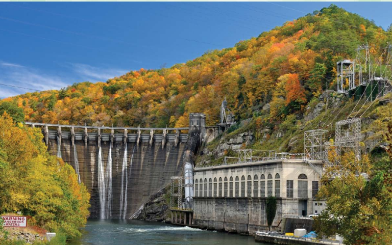
Brookfield Smoky Mountain Project- Cheoah Dam, NC

If you don't have internet access, please mail one copy of your filing to: Secretary, Federal Energy Regulatory Commission, 888 First Street NE, Washington, DC 20426. If filing via hard-copy, every filing of CEI or Privileged material must also contain a public document. In addition, you must send courtesy copies of those items listed on the previous pages to the appropriate office.