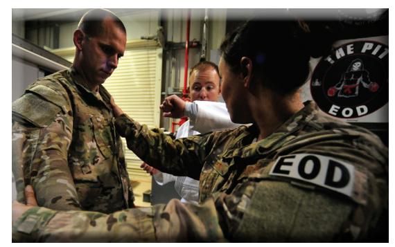
EOD may respond to pick up larger AE.

Individual war souvenirs must be specifically authorized by higher headquarters. Absent such authorization, weapons, munitions (AE) or military articles of equipment obtained or acquired by means other than official issue may not be kept for personal use or shipped out of the area of operations for personal reasons. Service Members who violate this policy risk criminal prosecution under the Uniform Code of Military Justice. Service Members must fill out Defense Department Form 603-1 and get approval from their chain of command before taking home a war trophy. However, because of the danger posed no one should expect approval will be provided to keep AE as a war souvenir.