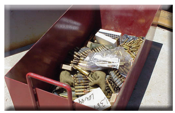
Small arms turned in at an amnesty box.

My battle buddy picked up an enemy munition as a war souvenir and wants to turn it in. How does he do that under the AE Amnesty Program so he will not get in trouble?