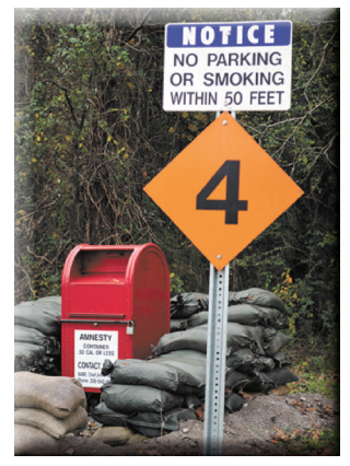
Typical amnesty turn-in point.

In 2006, two children were killed and several others injured by a grenade kept for over 15 years as a "conversation piece." The owner believed it was safe (inert), but tragically it was not. Is keeping a munition as a souvenir worth the risk posed to your family, friends or neighbors, or even career?