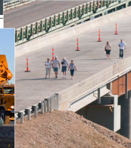
An ATC for the Hurricane Deck Bridge project in Missouri proposed building the bridge on a new alignment.