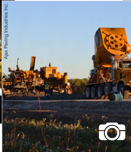
Image Gallery: A Michigan project included ATCs to accelerate construction while safely maintaining traffic.