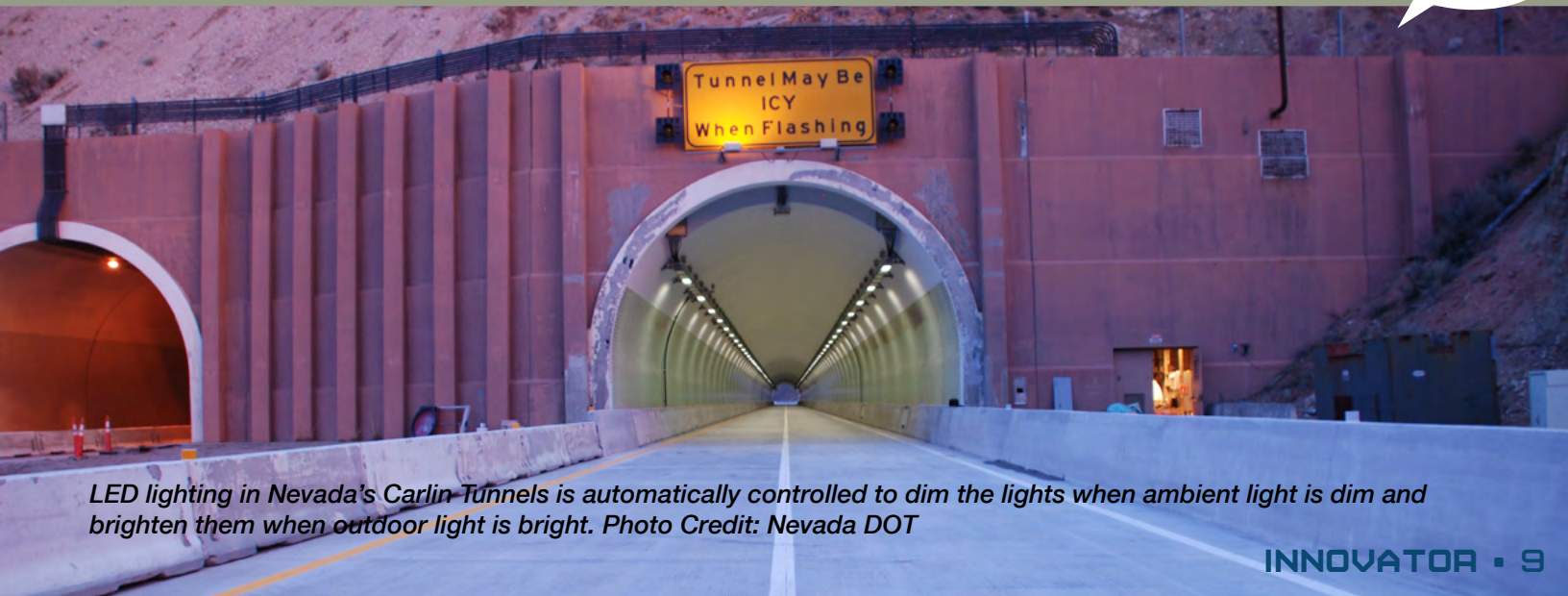
LED lighting in Nevada's Carlin Tunnels is automatically controlled to dim the lights when ambient light is dim and brighten them when outdoor light is bright.