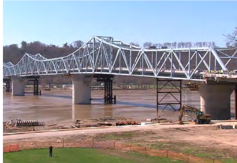
Milton-Madison Bridge slide

The project—a joint effort of the Indiana Department of Transportation and the Kentucky Transportation Cabinet—replaced a deteriorating bridge over the Ohio River connecting Milton, Kentucky, and Madison, Indiana. It was built using the design-build method, which saves time by overlapping the design and construction phases of the project.