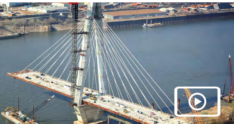
Overview of ATC process

ATC use is common on design-build projects, which combine the design and construction phases in one contract. They've also been used on projects built with the traditional design-bid-build delivery method and the construction manager/general contractor technique, a two-phase process that allows agencies to include a contractor's perspective in planning and design decisions.