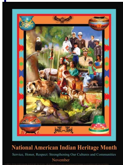
National American Indian Heritage Month Service, Honor, Respect: Strengthening Our Cultures and Communities November

VA is proud to join the Nation in commemorating National American Indian and Alaska Native Heritage Month during the month of November. This year's theme is "Service, Honor, Respect: Strengthening Our Cultures and Communities." Native Americans have contributed immeasurably to our country and our heritage, distinguishing themselves as scholars, artists, entrepreneurs, and leaders in all aspects of our society. They