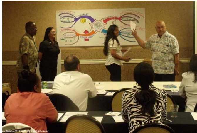
Participants at the VISN 22 Training