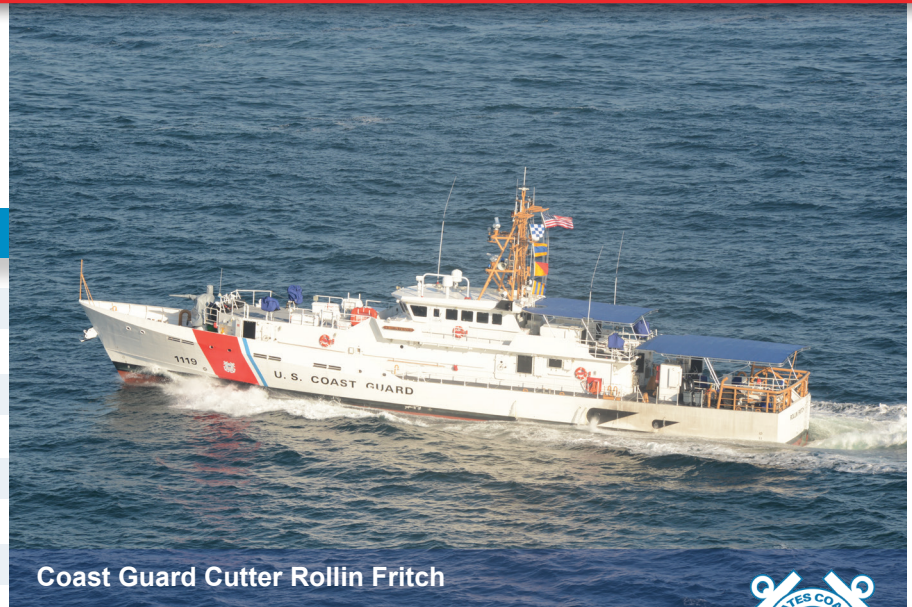
Coast Guard Cutter Rollin Fritch