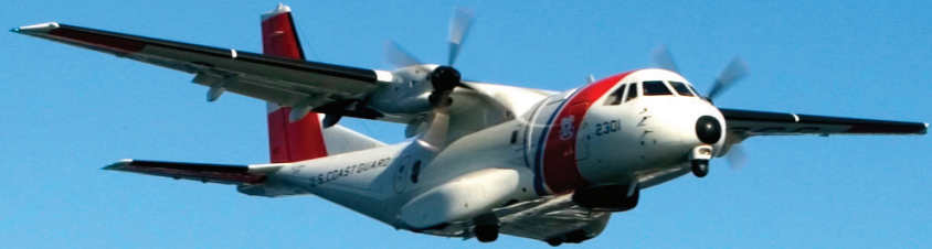
HC-144 Ocean Sentry