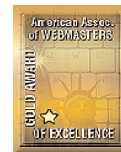
March, 2005 American Association of Webmasters Gold Award

ICE's Cornerstone Web site has received the following awards for excellence: