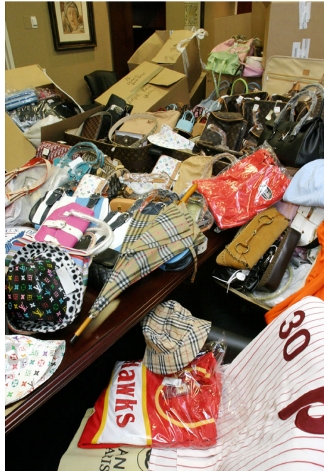
Some of the counterfeit designer goods seized in “Operation Executive” in New York are shown above. ICE seized at least 10 shipping containers filled with a total of over $40 million.

(Downey, CA, June 10)—An ICE drug trafficking investigation ended with the arrest of nine men on charges of conspiracy to import and distribute controlled sub-