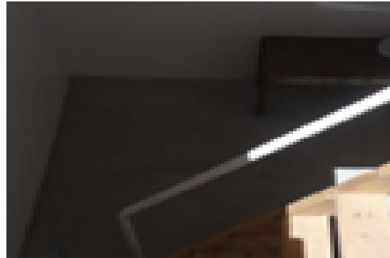
Figure 2. In-ground safe room.