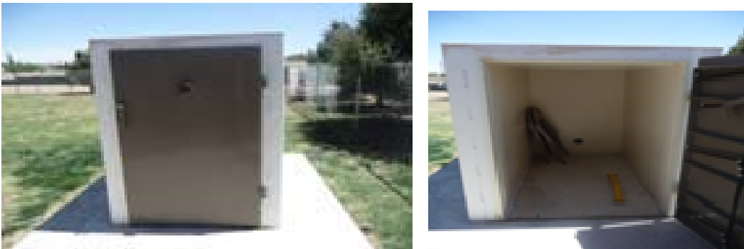
Figure 1. Aboveground safe room.

The Commission is a voluntary association of cities, counties, and special districts in the Texas Panhandle. As a council of governments, the Commission meets HMGP eligibility under 44 CFR 206.2(a)(16) as a local government. With HMGP grant funds, the Commission implemented the Residential Safe Room Construction project. The project reimbursed individual property owners up to $2,500 for the construction of a windstorm safe room to provide protection during a short-term, high-wind event such as a tornado or hurricane.