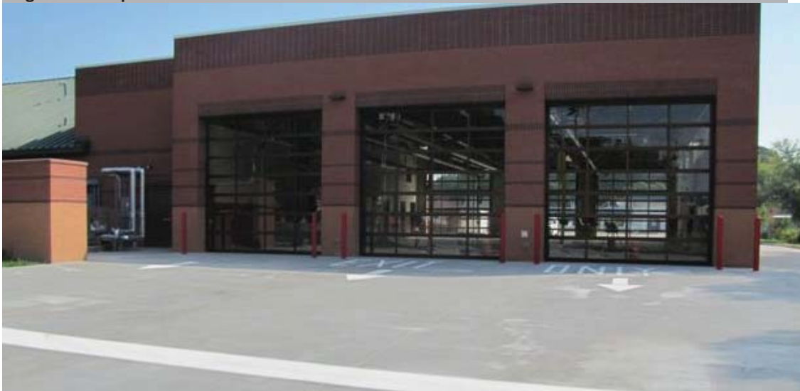
Figure 1: Newport News Fire Station No. 3

The American Recovery and Reinvestment Act of 2009 , as amended (Recovery Act), appropriated $210 million to the Federal Emergency Management Agency (FEMA) for competitive grants for modifying, upgrading, or constructing non-Federal fire stations. On September 25, 2009, FEMA awarded a grant of $2,597,425 to the Newport News Fire Department for constructing a new fire station (No. 3) in the City of Newport News, Virginia. The grant specified a period of performance from September 25, 2009, to September 24, 2012. As of October 24, 2011, the Newport News Fire Department had completed the construction of the new fire station (see figure 1) and had received reimbursements of $2,597,425 from FEMA for the construction of the project.