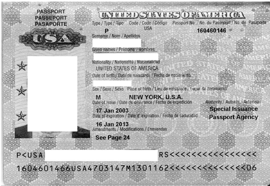
Personalized, a different “passport number” appears both in the upper right corner, and also in an OCR font in the machine readable zone.