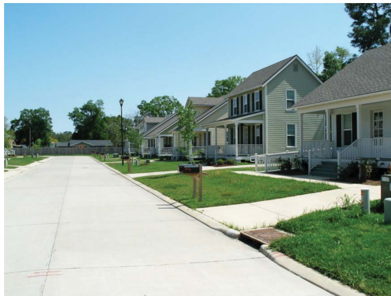
Lake Charles Louisiana Katrina Cottages group site

In Lake Charles, a group site and city-acquired scattered sites have been developed in conjunction with two nonprofit partner organizations. Construction of the 34 single-family cottages at the group site started in April 2009 and was completed in December 2009. Construction at the 35 scattered sites started in November 2009 and was completed in February 2011. Not all of these units had occupants at the time of our site visit in March 2011.