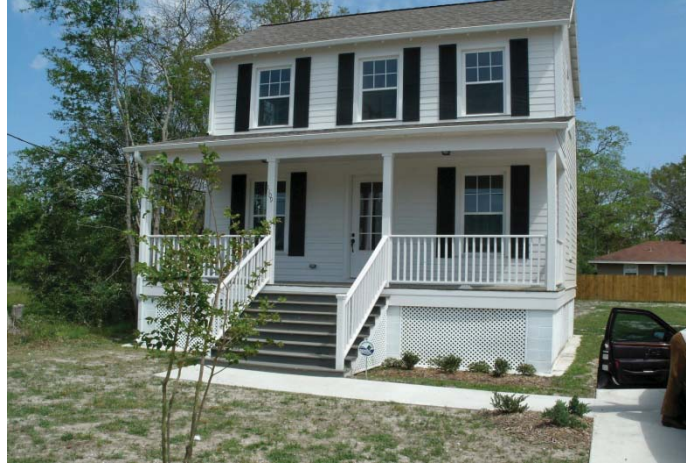
Louisiana Katrina Cottage

In the awards announcement on December 22, 2006, the Louisiana Katrina Cottages and Carpet Cottages proposal was funded for up to $74,542,370, or 85% of the requested $87,696,906. The Louisiana Housing Finance Agency (LHFA) was the program administrator for the Louisiana Pilot Program. The grant agreement was not made until September 7, 2007. More than 8 months were spent establishing the details of the articles of agreement, including management and oversight arrangements, and amending the state's original application package. The period of performance was established from September 17, 2007, through September 16, 2011.