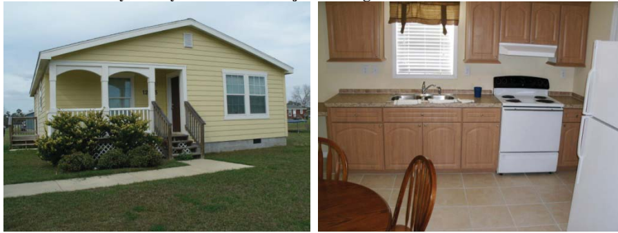
Part of the City of Bayou La Batre development