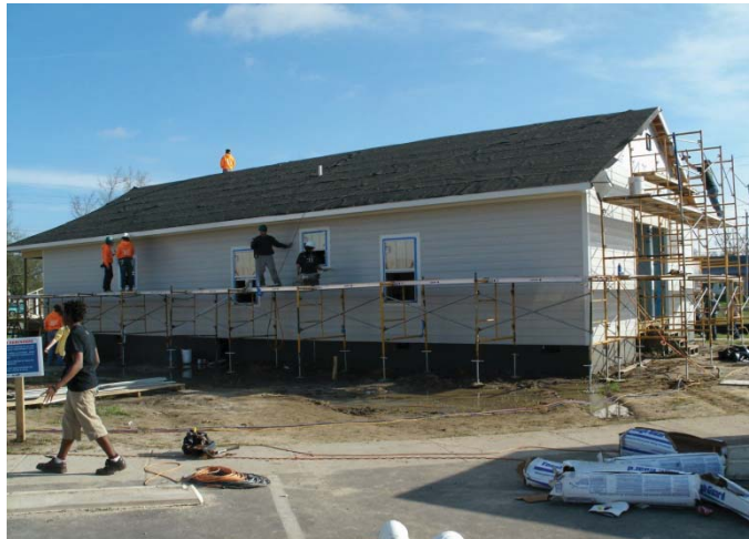
Habitat for Humanity Bay St. Louis, Mississippi, Eco Cottage under construction

The Habitat for Humanity Bay-Waveland site in Bay St. Louis had some nearly completed Eco Cottage structures and others being built by Habitat for Humanity professionals assisted by large numbers of volunteers. The cottages were being constructed using traditional methods with some preconstructed panels. Habitat for Humanity Bay-Waveland officials plan to complete the units using this summer's volunteers.