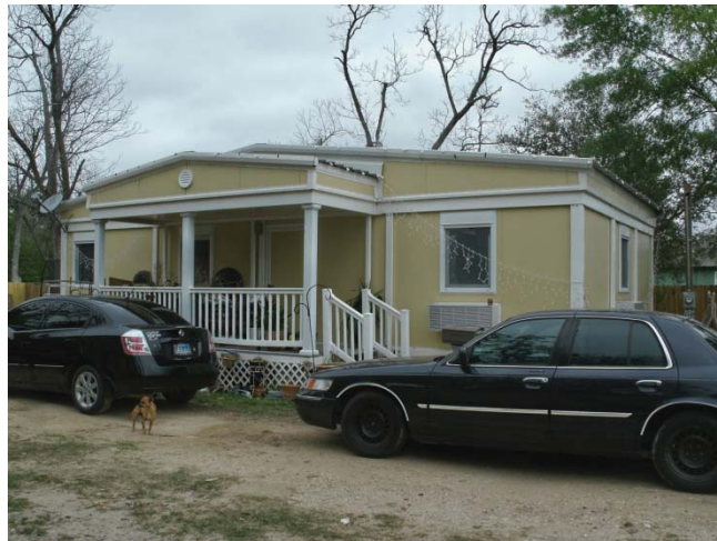
Completed Heston Group USA housing unit

contractor. TDHCA officials even provided Heston Group USA with guidance to respond to the default notice, as TDHCA was seeking a realistic reset for the contract. Heston Group USA provided a response that TDHCA officials did not consider adequate. Therefore, the contract was terminated on July 31, 2009. In March 2011, Heston Group USA filed suit against the state of Texas.