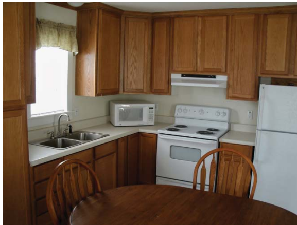
Kitchen of a Mississippi Cottage

were delivered and accepted in August 2007. The last of the units were received in December 2009. Ultimately, MEMA accepted 3,075 units from the six manufacturers: 1,450 Park Models, 600 two-bedroom Mississippi Cottages, 600 two-bedroom UFAS-compliant Mississippi Cottages, 325 three-bedroom Mississippi Cottages, and 100 three-bedroom UFAS-compliant Mississippi Cottages.