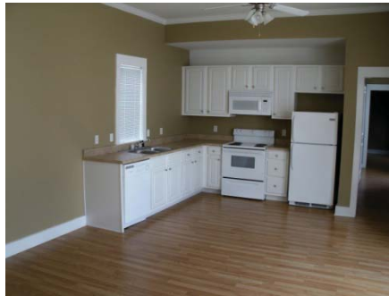
Kitchen of Louisiana Carpet Cottage

Construction of the Jackson Barracks units was delayed when the site development work needed for the first location selected proved too costly and another area of the barracks had to be selected. Nevertheless, construction of the single-family cottages at Jackson Barracks started in February 2009 and was completed in December 2009. Construction of the Carpet Cottages started in August 2009 and was completed in April 2010.