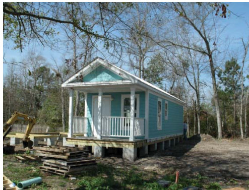
A Mississippi Park Model

The Mississippi proposal offered to construct 7,261 Park Model housing units and 1,933 Mississippi Cottages for $400 million. The Park Models proposed, at 462 square feet per unit, were similar in size to FEMA park model trailers but had several enhancements, including improved durability, ability to withstand winds of up to 150 mph, 8-foot ceilings, attic storage space, ENERGY STAR heating, ventilation and air-conditioning systems, no roof penetrations, rot/mold/moisture-resistant materials, a front porch, and a style reflecting the Mississippi gulf coast architectural heritage.