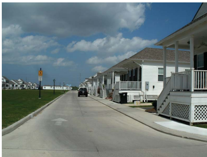
Jackson Barracks Louisiana Katrina Cottage Pilot Program housing units

Construction of the Jackson Barracks units was delayed when the site development work needed for the first location selected proved too costly and another area of the barracks had to be selected. Nevertheless, construction of the single-family cottages at Jackson Barracks started in February 2009 and was completed in December 2009. Construction of the Carpet Cottages started in August 2009 and was completed in April 2010.