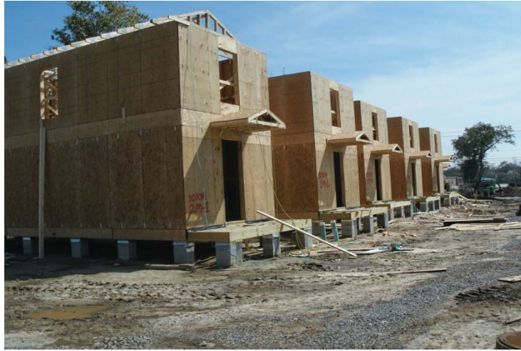
Mercy Housing Pass Christian, Mississippi, Eco Cottages under construction

The Habitat for Humanity Bay-Waveland site in Bay St. Louis had some nearly completed Eco Cottage structures and others being built by Habitat for Humanity professionals assisted by large numbers of volunteers. The cottages were being constructed using traditional methods with some preconstructed panels. Habitat for Humanity Bay-Waveland officials plan to complete the units using this summer's volunteers.