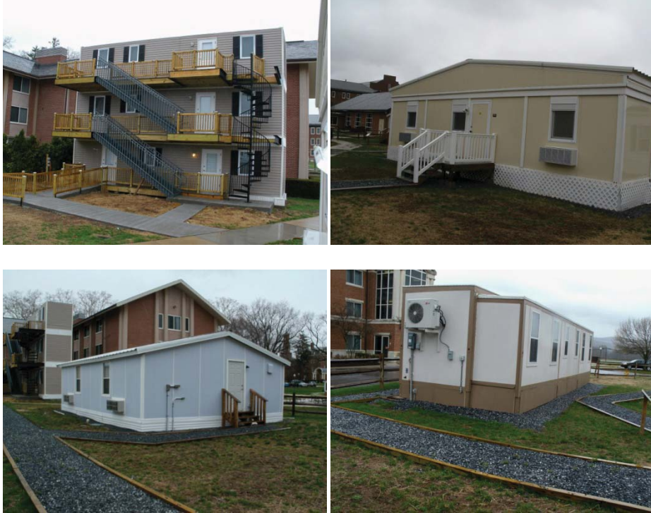
Housing units being tested at Emmittsburg, Maryland

The costs of the units, which differ significantly in size, ranged from approximately $19,000 to $70,000, including installation at the seven FEMA-prepared sites. The unit costs were higher because the units were equipped with fire-suppression systems owing to their use as student temporary housing. This would not be the case where local fire codes do not specify that homes must have sprinkler systems. However, all of the units cost more than comparable travel trailers, park models, and manufactured housing units that FEMA traditionally has used after past disasters.