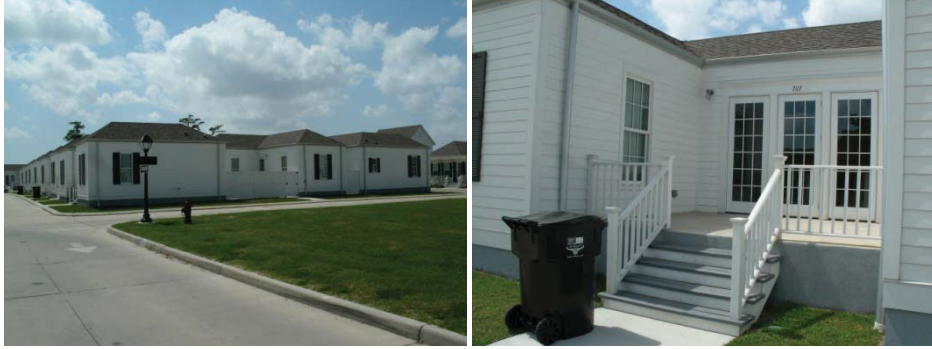
Carpet Cottages at Jackson Barracks—exterior and entrance to a unit