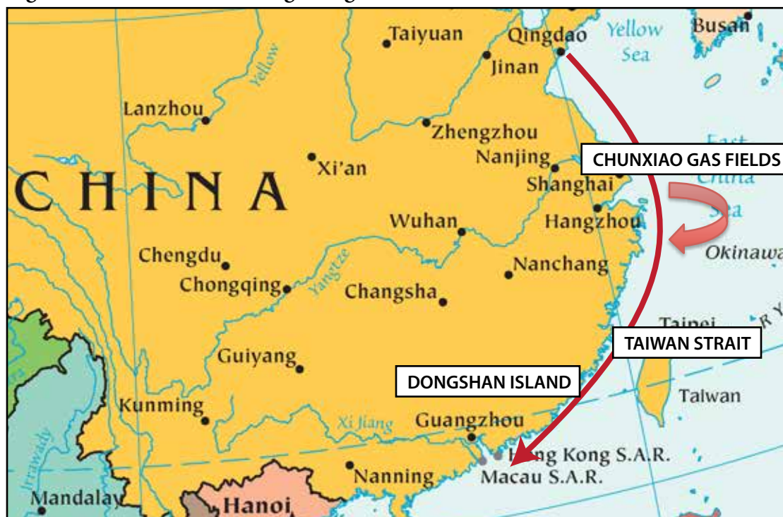
Figure 1. 2004–2006 PLAN Signaling

According to Japanese press reporting, in January 2005 a Japanese Maritime Self Defense Force (JMSDF) P-3 maritime reconnaissance aircraft spotted two Sovremenny -class destroyers sailing near the disputed Chunxiao gas fields. According to the article, “this was the first sighting of the Chinese navy’s most advanced destroyers in waters under Japanese surveillance.” 27 The following September, just prior to bilateral talks on the disputed fields, Japan’s Defense Agency again spotted PLAN ships sailing in a clockwise direction in the waters around the Chunxiao fields. The formation consisted of a Sovremenny destroyer, two frigates, and an intelligence collection ship. 28 The timing of this naval activity just prior to Chinese talks with Japan suggests PRC signaling. More importantly, however, this training enabled the PLAN to familiarize itself with unfamiliar waters, which could be used in a future Japan contingency, thereby expanding PLAN near seas active defense capabilities.