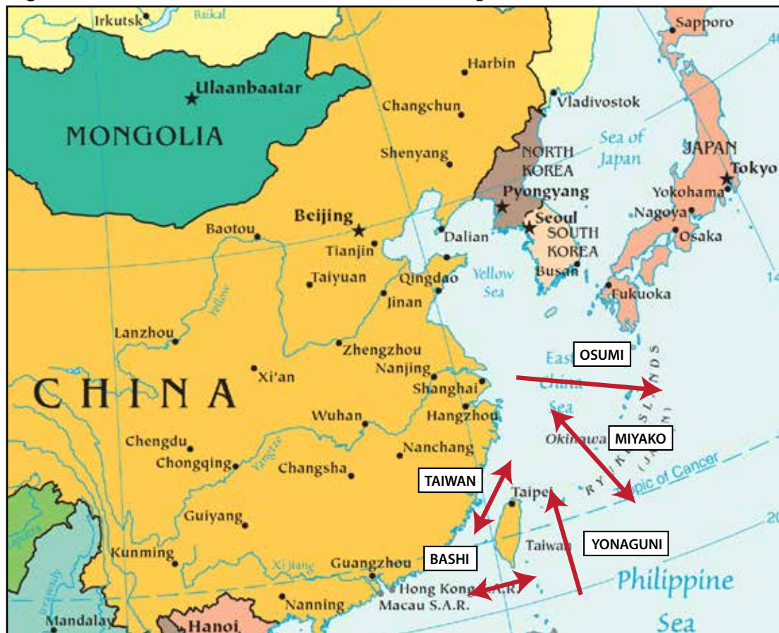
Figure 3. 2010–2012 PLAN Western Pacific Chokepoint Transits

The PLAN diversified access routes to the Pacific Ocean from 2010 to 2012. While the Miyako was the most frequently used channel, the PLAN also used the Osumi Channel and the Yonaguni Channel for the first time (see figure 3). The diversification of access routes to the