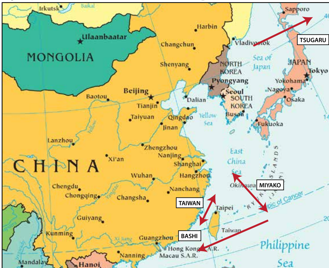
Figure 2. 2004–2009 PLAN Western Pacific Chokepoint Transits

execution of these operations further enhances the PLAN ability to execute near seas active defense and improve capabilities that are also germane to new historic missions.