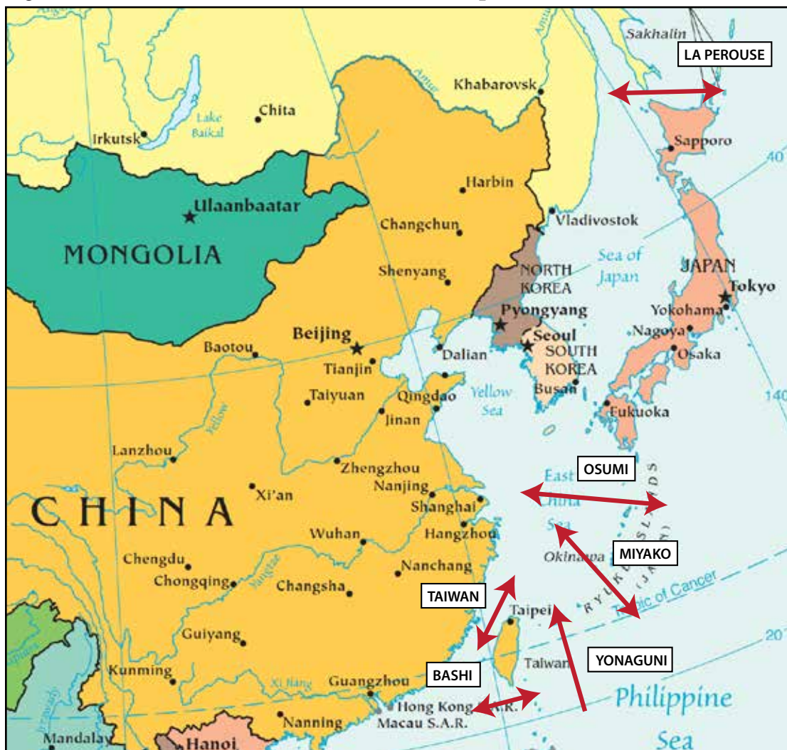
Figure 4. 2013–2014 PLAN Western Pacific Chokepoint Transits

A third likely signal to Japan came from PLAN utilization of the La Perouse Strait following a bilateral exercise with the Russian Navy. Five PLAN ships transited east through the La Perouse Strait and circumnavigated Japan rather than using a direct route and transiting back through the Sea of Japan to their North Sea Fleet homeport following the Vladivostok-based exercise. 87 This deployment illustrates an expansion of SLOCs used by the PLAN to access the Western Pacific; more significantly, Chinese Navy officials referred to the transit as "cutting the