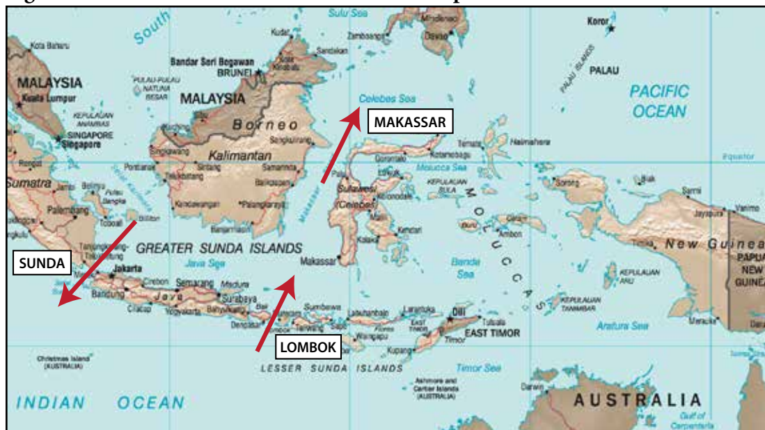
Figure 5. 2013–2014 PLAN Indian Ocean Chokepoint Transits

Chinese press covered this deployment extensively, referring to the operation as a “combat readiness patrol.” This terminology is important because it is normally reserved for PLAN patrols in the near seas. A combat readiness patrol that included antisubmarine warfare training in the Indian Ocean suggests the PLAN is beginning to extend its combat capabilities out from the near seas and operationalize a far seas defense doctrine.