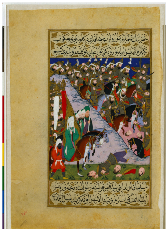
Muhammad depicted with his face obscured, "The Prophet Muhammad and the Muslim army at the battle of Uhud," (Medina, year 625). From Siyar-i-Nabi, made for Sultan Murad III, Ottoman, Constantinople, c.1594.

his Arabic-language blog during the first week of September. 11 The promotion included, among other items, a picture of Pastor Jones in front of the White House and a bloody cartoon purporting to show the Muslim Prophet. The öscreeningö of the video was announced to coincide with öThe International Judge Muhammad Day,ö scheduled for September 11 in Gainesville, Florida. (See illustration 1.)