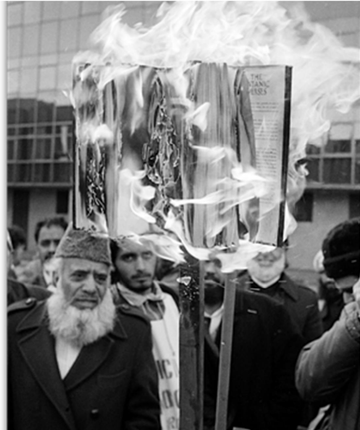
Satanic Verses Book Burning, Bradford, UK, January 9, 1989