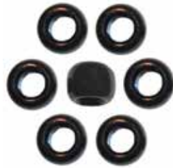
Black beads = Lithosphere