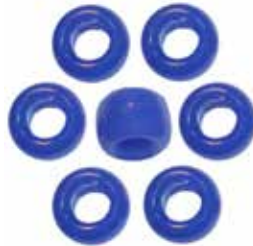
Blue beads = Hydrosphere