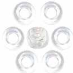
Clear beads = Atmosphere