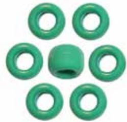
Green beads = Biosphere

Record your journey through the carbon cycle on this page. Beginning at one end of your pipe cleaner, write the "sphere" you visited for each bead on the pipe cleaner.