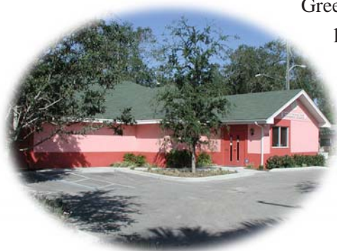
The Willa Carson Health Resource Center in Clearwater, Florida.