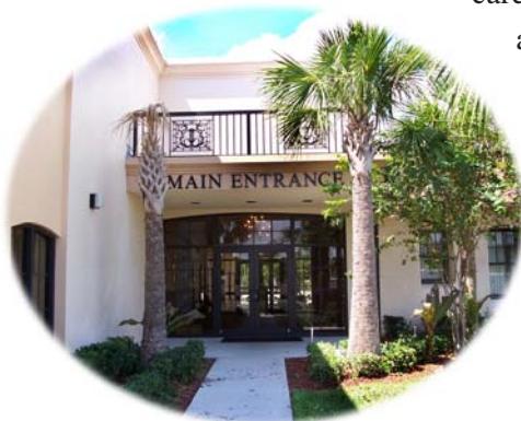
The completed Johnnie Ruth Clarke Health Center in St. Petersburg, Florida.

facility is a state-of-the-art, federally-qualified health care center that created more than 100 jobs and serves up to 300 patients a day. Florida A&M University offers a pharmacy program and training center at the facility, and the University of Florida offers a Dentistry program onsite. In addition to providing affordable and accessible health care and health-related education, the facility has catalyzed additional