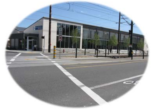
The completed Portland-Providence Health Services Facility in Portland, Oregon.