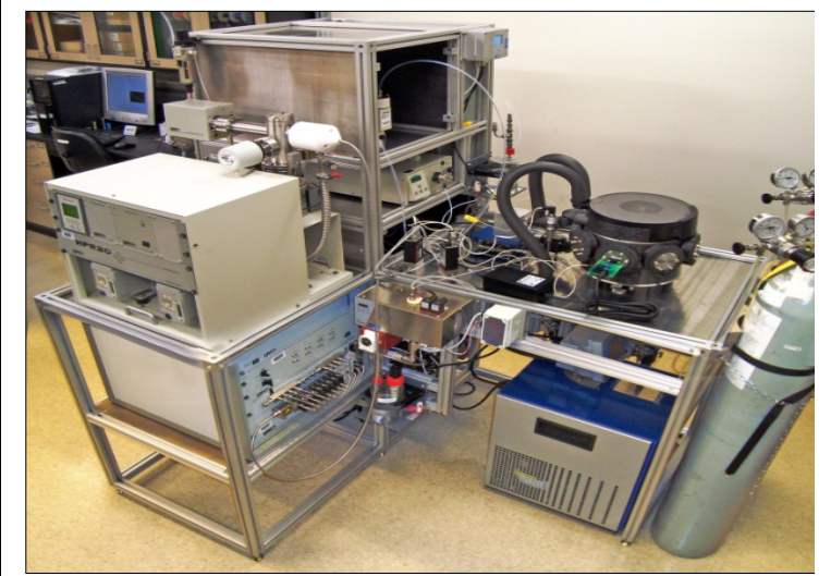
Figure 3.7.3.1 Hydrogen Sensor Test Facility at NREL

assessment of hydrogen sensors under well-defined protocols.