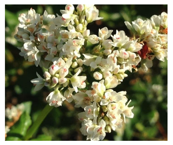
Buckwheat flowers.

Pollinator and beneficial insect habitat: Buckwheat is an excellent plant for bee pasture and insectary gardens (Mader et al., 2011; Lee-Mader et al., 2014). The plants produce numerous, shallow white flowers and abundant nectar, and bloom in the late summer when other plants are no longer blooming (Oplinger et al., 1989). About one acre of buckwheat can provide enough forage for a hive of honey bees, producing about 150 pounds of honey in one season (Oplinger et al., 1989; Myers and Meinke, 1994). The flowers also attract beneficial insects such as parasitic wasps, minute pirate bugs, insidious flower bugs, tachinid flies, ladybeetles and hoverflies, which may prey on insect pests of neighboring crops (Clark, 2007; Bjorkman and Shail, 2010).