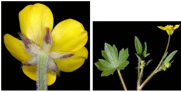
Figure 1. R. repens (left) and R. occidentalis (right) receptacle views. Photo courtesy of G.D. Carr, Oregon Flora Image Project. 2007, 2008.

repens ). The non-native creeping buttercup ( R. repens ) frequents similar habitats and is undesirable due to its invasive status and weediness (Ball et al., 2006). Because this species has such a broad distribution and multiple varieties, it is commonly misidentified. Generally, R. repens tends to stay close to the ground, bunch together, and “creep,” but this characteristic alone is not a reliable way to differentiate, since R. occidentalis can also keep a low profile under certain environmental conditions. If the plants are in bloom, petals of the western buttercup are more pointed and not so overlapped as the rounder and fuller petals of the creeping buttercup, and the receptacle (stem and base under the flower) of the creeping buttercup is fuzzy or hairy while the western is smooth (Figure 2). When not in bloom the dark green leaves of R. repens have light patches or spots that R. occidentalis leaves do not.