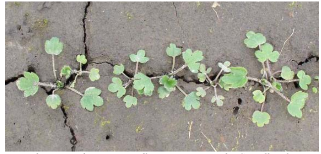
Figure 2. Western buttercup seedlings sprouting at the Corvallis Plant Materials Center.

Seeds germinate best at cool temperatures (50–60°F) and stands are best established by directly sowing in the fall; alternately, plugs can be transplanted in the fall. Broadcast at a single species application rate of 6 to 7 pounds pure live seed (pls) per acre. Western buttercup has approximately 200,000 seeds per pound, so applying seed at a rate of one pound per acre will result in about 5 seeds per square foot. Germination begins 5 to 6 weeks after fall sowing. The plants will grow throughout winter,