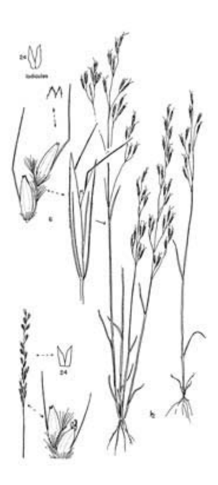
Line drawing of Deschampsia danthonioides reprinted with permission, University of Washington Press.