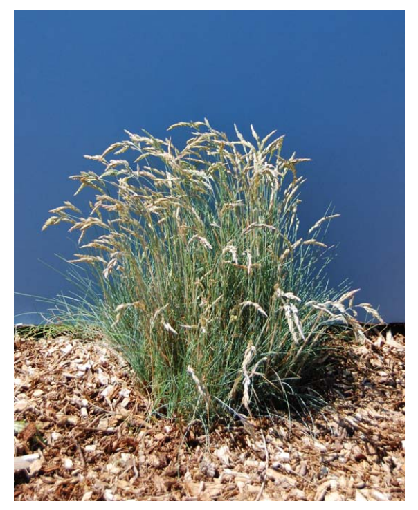
Figure 1. Sand fescue in flower.

Contributed by: USDA NRCS Plant Materials Center, Corvallis, Oregon